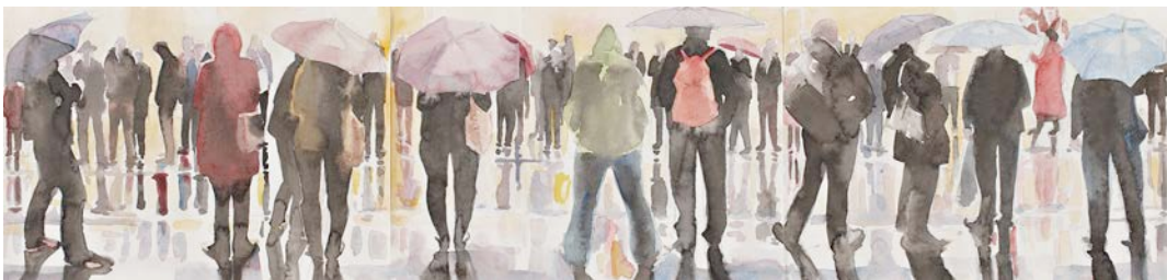
Figure 6: Barbara Bolt, Study for Bourke Street 5pm , 2012, watercolour on arches, 45 cm x 113 cm