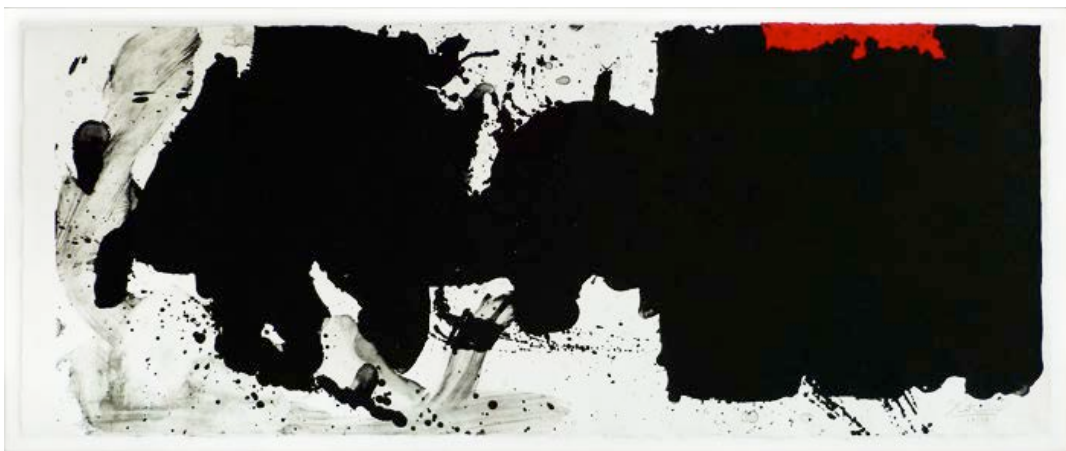
Figure 2: Robert Motherwell, Black with No Way Out 1981, 1983 , lithograph printed in black and red from two aluminium plates, sheet 38.4 x 95.4 cm, National Gallery of Australia, Canberra; Gift of Kenneth Tyler, 2002 © Dedalus Foundation, Inc./VAGA. Licensed by Viscopy.

all that has happened in the recent history of Australia has been made possible by the colonisation and often the deaths of Aboriginal Australians ... the idea that there was a wrong that needed to be acknowledged and addressed. 4