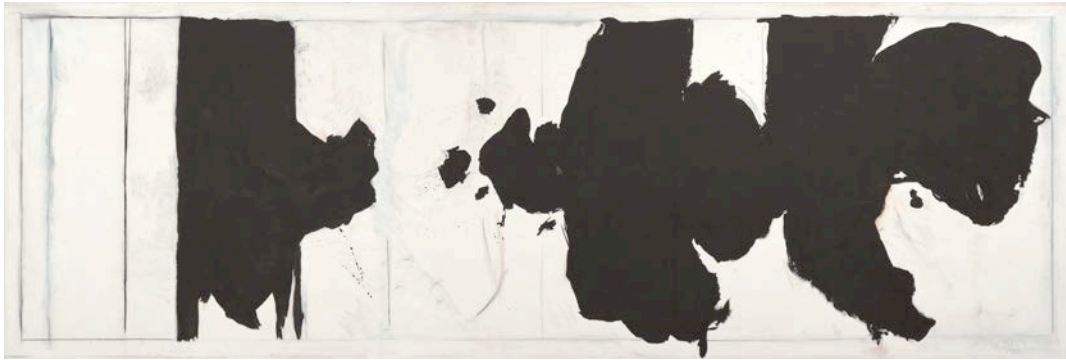
Figure 3: Robert Motherwell, Reconciliation Elegy, 1978, acrylic on canvas, 304 cm x 914.4 cm

reasons. Partly from a conversation the same year with the Spanish artist Tàpies chez moi about the new hopes for humanism in Spain—my Elegies to the Spanish Republic had been meant, on one level, as an elegy for the tragically missed opportunity of Spain to enter the liberal world in the 1930s. And for its tragic suffering then and for decades after. 23