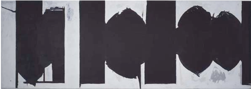
Figure 7: Robert Motherwell, Elegy to the Spanish Republic 100 , 1963–1975, acrylic on canvas, 213.36 x 609.6 cm; © Dedalus Foundation, Inc/VAGA. Licensed by Viscopy, 2015.