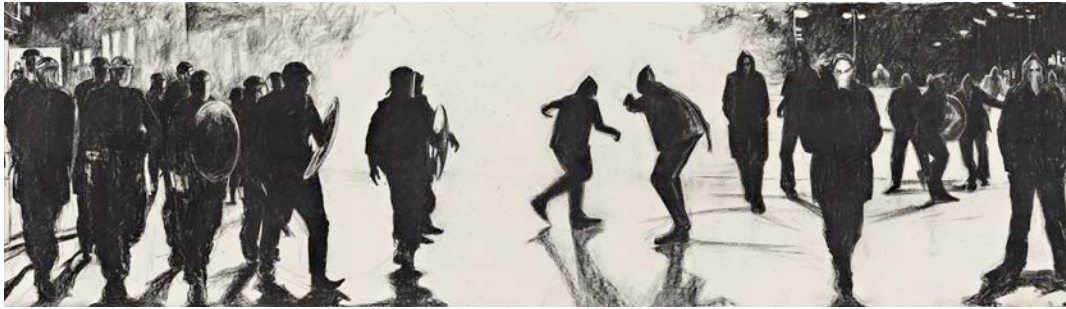
Figure 1: Barbara Bolt, Black with No Way Out (after Motherwell) , 2012, charcoal on arches, 114 cm x 390 cm