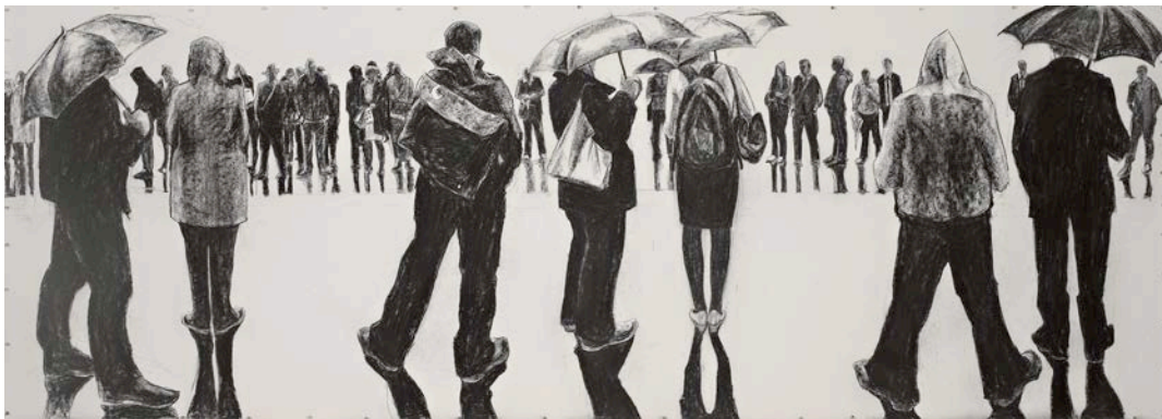
Figure 8: Barbara Bolt, Elegy to an Oz Republic (after Motherwell) , 2012, charcoal on arches, 114 x 310 cm

heavily on us that Motherwell's painting has. Nor does it display the tightly compressed figures that make up John Brack's oppressive Collins St, 5p.m. But what it does do is produce an almost imperceptible shift in perspective, one that operates through the rhythms and perspectives of the work.