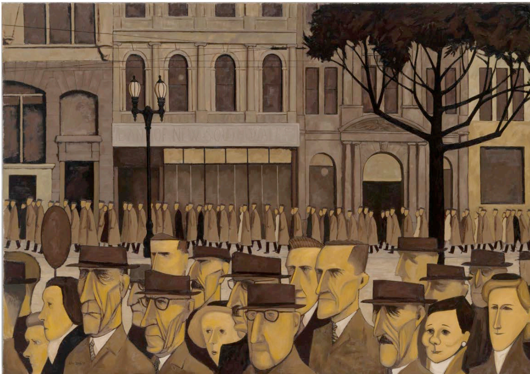
Figure 5: John Brack, Collins St., 5p.m. 1955, oil on canvas, 114.8 x 162.8 cm, National Gallery of Victoria, Melbourne

So what are we to experience here? While loosely 'composed' using the dynamics of Motherwell's Elegy to the Spanish Republic 100 , it doesn't convey the force and power of the massing black shapes pushing and shoving and weighing