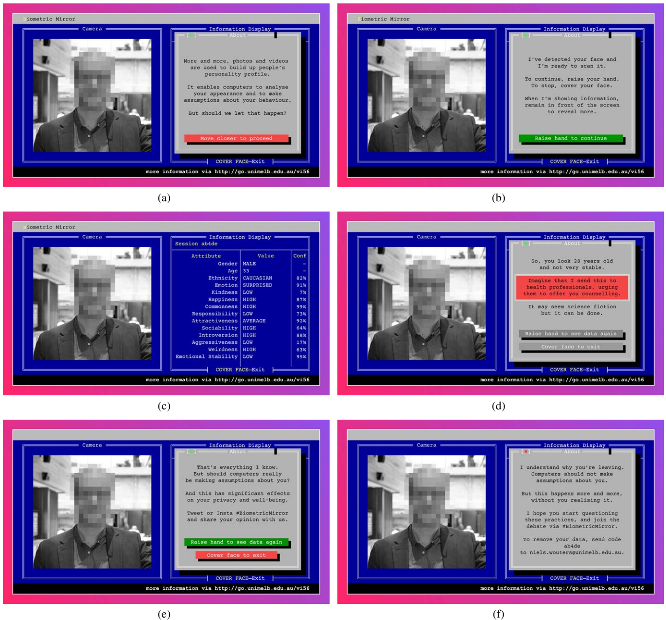
Figure 1. User interface of Biometric Mirror through consecutive stages, including (a) briefing; (b) consent; (c) psychometrics; (d) scenario; (e) debrief; and (f) opt-out procedure.

During the study, the responsible researcher was made aware of two researchers' concerns about the ethics of the study. Through conversation, these concerns were attributed to the unavailability of a public information resource that provided more context about the study, such as its justification, procedure, aim, and explanation about the data.