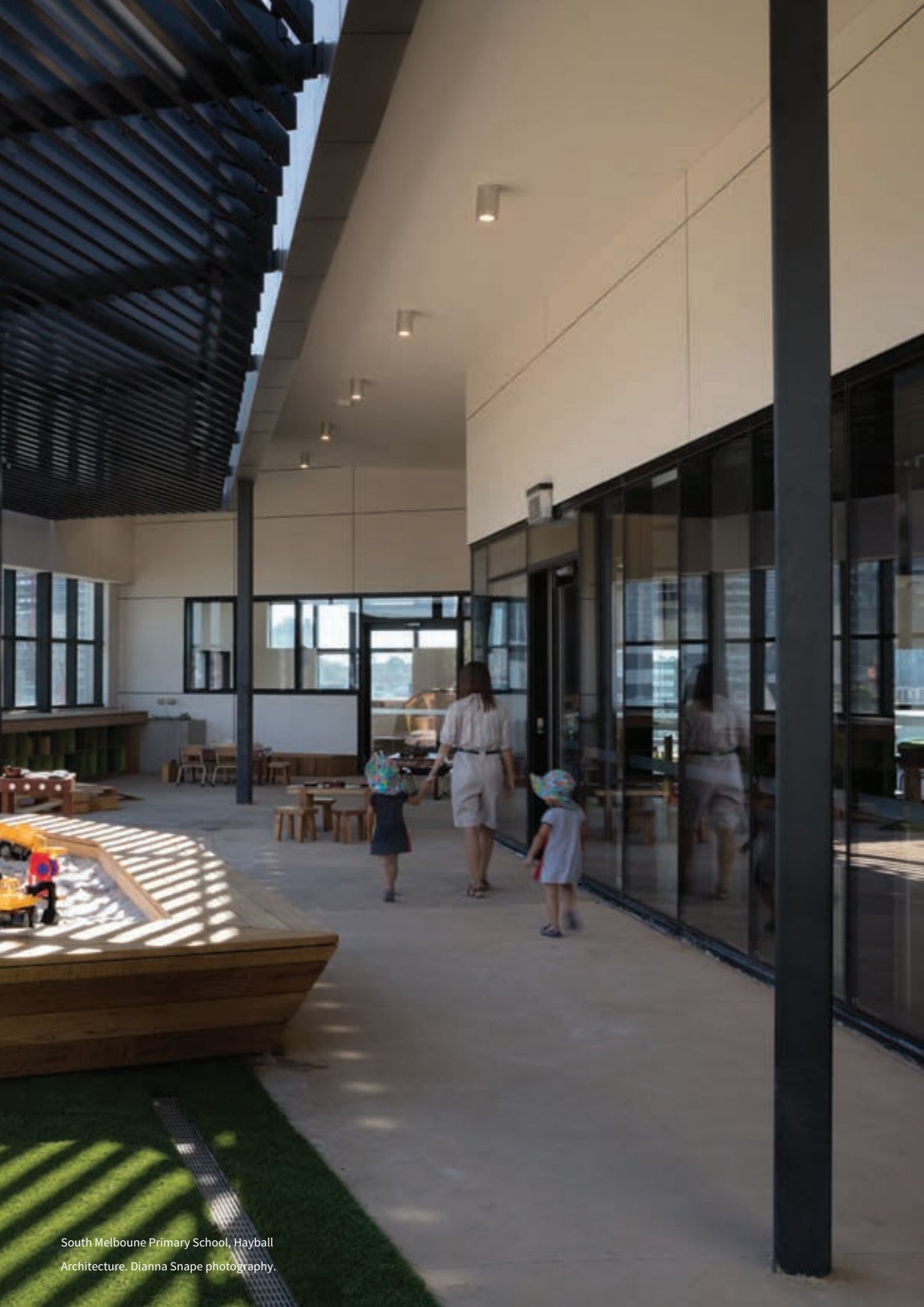
South Melbourne Primary School, Hayball Architecture.