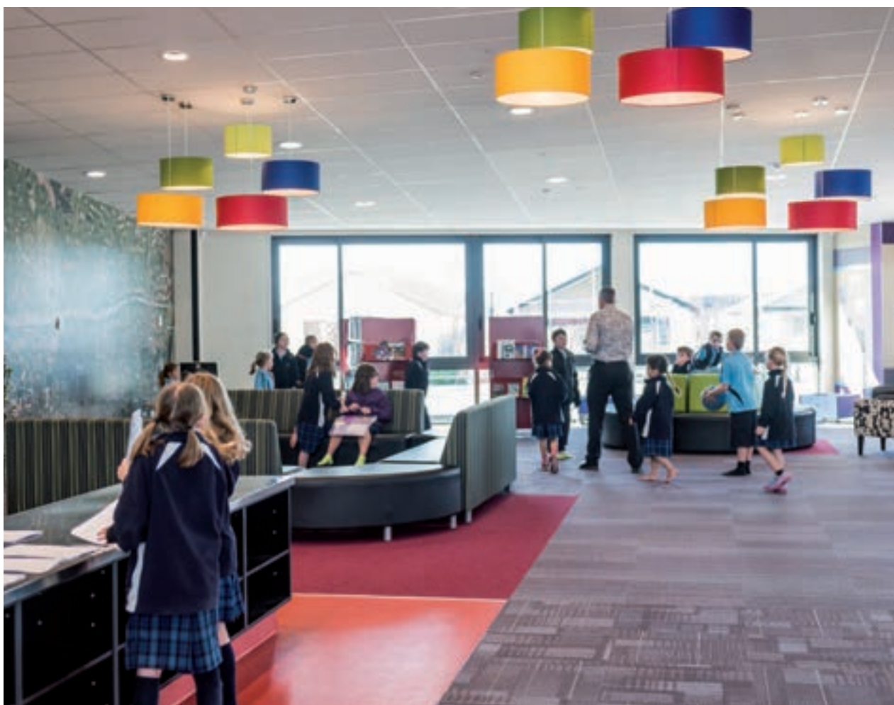
Pegasus Primary School, Jasmax Architects.