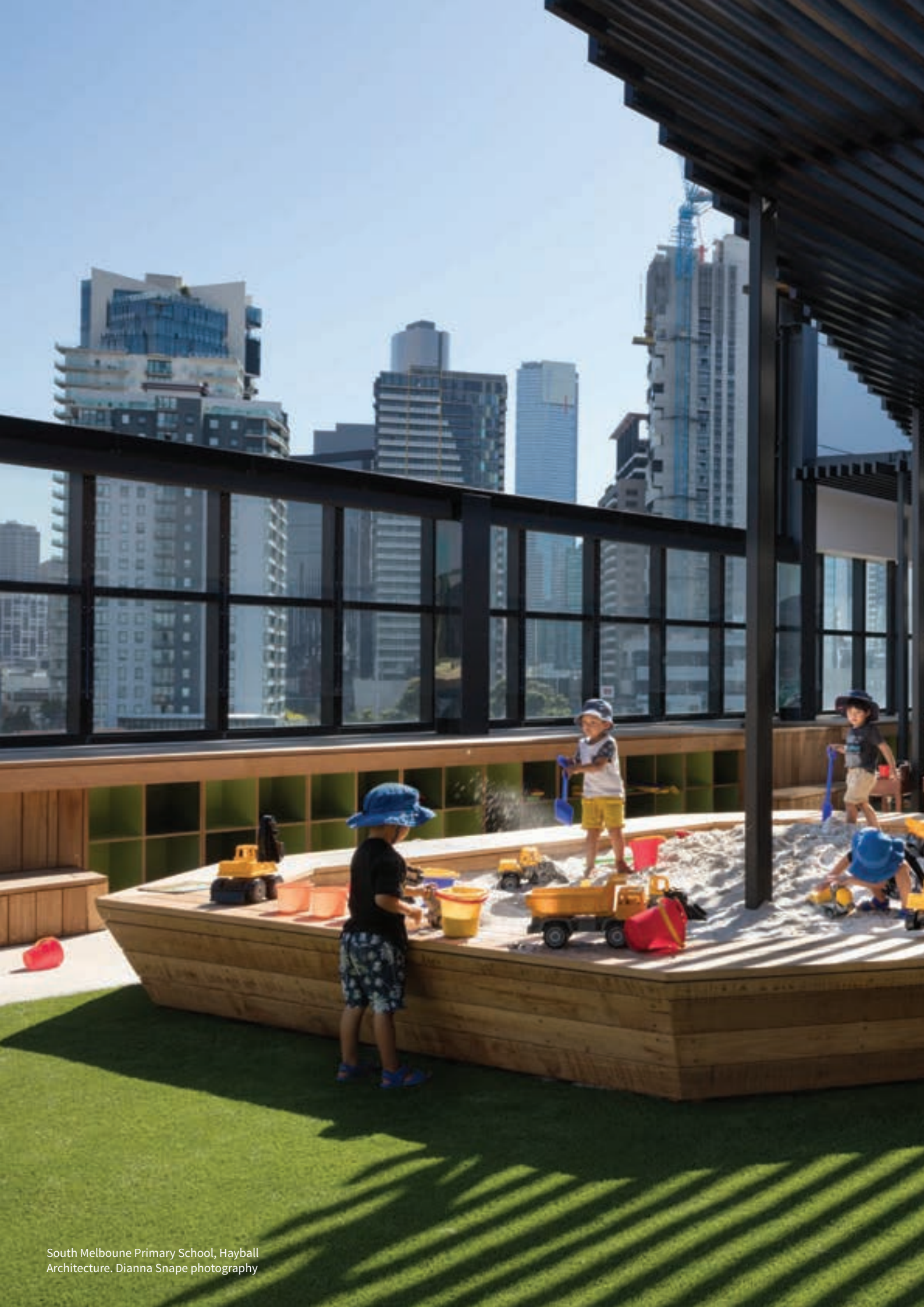
South Melbourne Primary School, Hayball Architecture. Dianna Snape photography