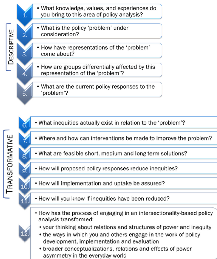
Figure 2 Descriptive & transformative overarching questions of IBPA.