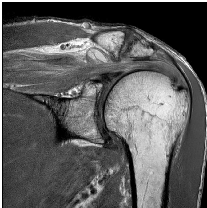
Figure 1. Pre-treatment shoulder MRI

At the six-week post-implantation review, the patient was pleased with his progress. He had increased his levels of activity without significant shoulder pain and was able to work in his 11-acre garden with marginal discomfort. He was referred to physiotherapy for a strength-based exercise program focusing on shoulder girdle and rotator cuff strength.