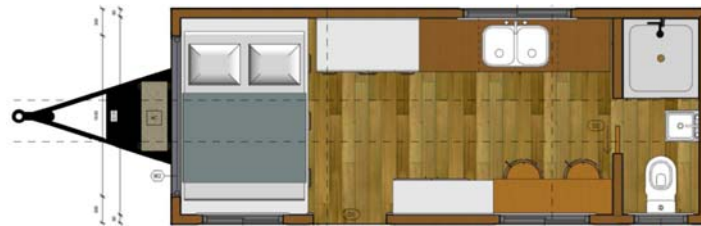
Figure 1. Tiny house case study floorplan [13]

A case study approach was used to evaluate the potential of tiny houses to reduce GHG emissions associated with housing. Drawings for a typical tiny house were sourced from a tiny house builder in Melbourne, Australia. The tiny house is 6m × 2.4m × 3.6m (12.2m 2 NCFAs) and is built on a steel-framed trailer, with softwood timber framed walls and roof, corrugated steel roofing, painted plasterboard internal linings, particleboard and laminated timber flooring, timber weatherboard cladding, aluminium single glazed windows, cabinetry, kitchen and bathroom fittings.