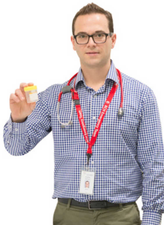
Table 2 Approaches to urine sample collection in primary care

'... it's not uncommon for GPs to treat empirically.' (13, regional GP registrar)