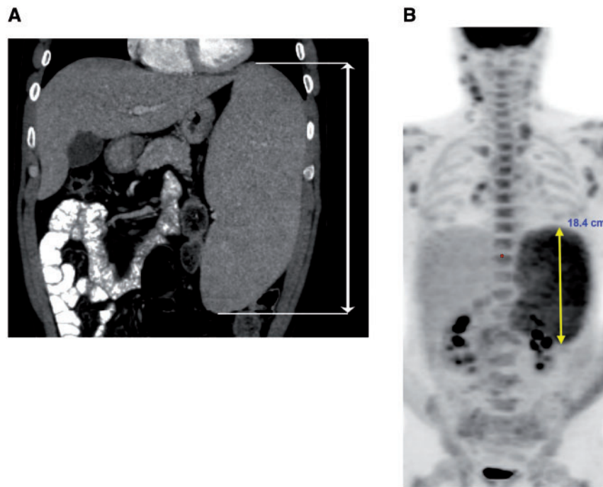
Figure 3. Recommendation for measuring spleen long diameter. (A) Coronal view of a computerized tomography (CT) scan image, (B) maximum intensity projection image of a positron emission tomography/CT.