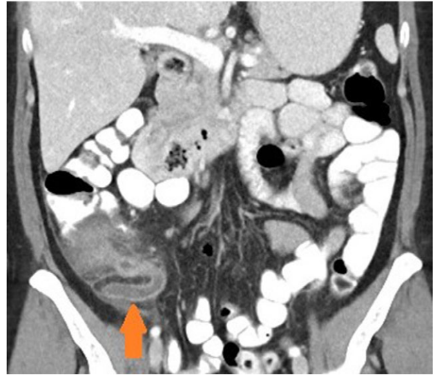
Figure 3: Coronal view of patient with appendicitis. Dilated and thick walled appendix (arrow).

The second patient had a laparoscopy, and appendicitis with serosal inflammatory changes of the caecum was noted. Due to a fragile appendiceal base, a laparoscopic ileo-colic resection was completed. She required a 5-day stay in hospital with