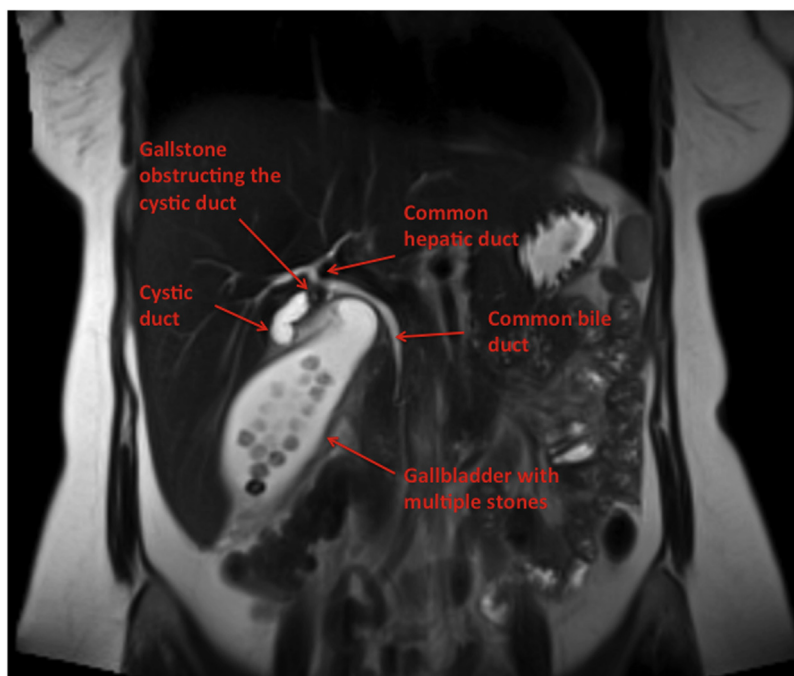
Fig. 2. Magnetic resonance cholangiopancreatography demonstrating a gallstone in the cystic duct just distal to its junction with the common hepatic duct and cholelithiasis. At least 15 large stones are visible in the gallbladder, and two more stones in the cystic duct, each measuring around 6.9 mm.

ing the cystic duct with at least 15 other sizeable stones within the gallbladder itself (Fig. 2). An urgent laparoscopic cholecystectomy confirmed a grossly distended gallbladder and follow up histopathology showed a suppurative gallbladder mucocoele with acute-on-chronic cholecystitis secondary to cholelithiasis.