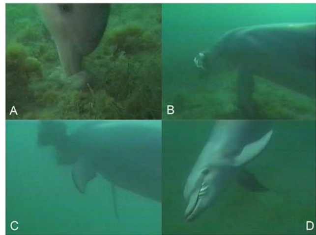
Figure 2. Prey handling of giant cuttlefish ( Sepia apama ) by Indo-Pacific bottlenose dolphin ( Tursiops aduncus ). Prey: (a) pinned to substrate and killed; (b) lifted towards surface; (c) beaten with snout to release ink; (d) consumed whole. doi:10.1371/journal.pone.0004217.g002