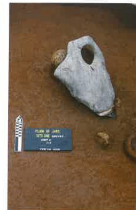
THE UNIQUE LIMESTONE BLOCK PLACED OVER THE PRIMARY BURIAL AT SITE 1.

Another avenue of research involves trying to discern connections between these sites and similar sites outside of Laos. One of the most intriguing connections is between the Plain of Jars and similar jars that are found nearly 1200 kms away in Assam, Northeast India. Morphologically the jars of the two locations are very alike and are located in similar environments and there is a potential linguistic connection as speakers of Austroasiatic languages are found in both locations. Another location with comparable jars can be found in Central Sulawesi although these do not bear as much resemblance to the Laotian jars as those of Assam.