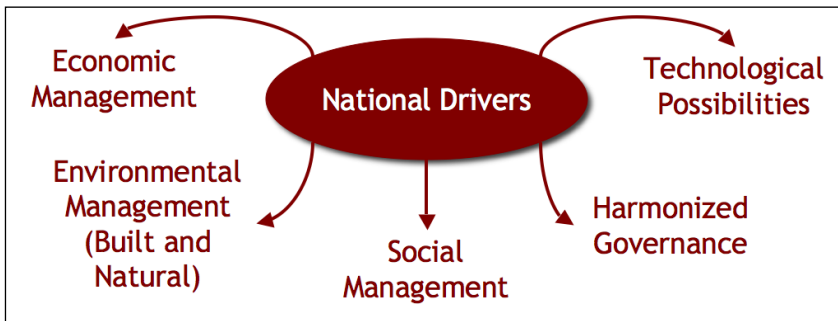
Figure 1. National Drivers for an Infrastructure to Manage Land Information