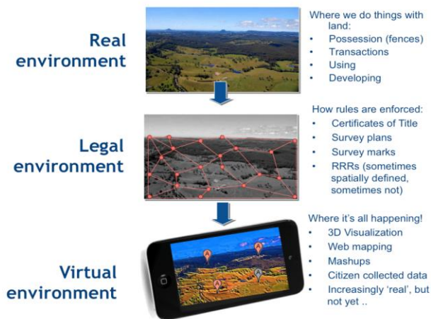
Figure 3. The three distinct environments of parcel information (Bennett et al. 2010)