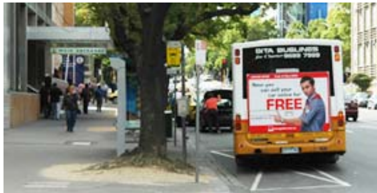
Figure 1: If the bus is missed riding with cars becomes an alternative, which requires ad-hoc trip planning.

Imagine Hillary who just has missed her bus to work today (Figure 1). Around Hillary the traffic is floating. Now she is glad to have subscribed to a service that mediates between her current transportation needs and vehicles going into her direction in an ad-hoc manner. Hillary switches on her portable hand-held device, and it starts negotiating with devices in the vehicles close-by. The service determines and books an optimal offer, and soon after Hillary sees a friendly car driver stopping for sharing a ride. The ride takes her a first leg of her trip, and during the ride her device collects further offers and books the next leg. Hillary will not come late to her appointment today.