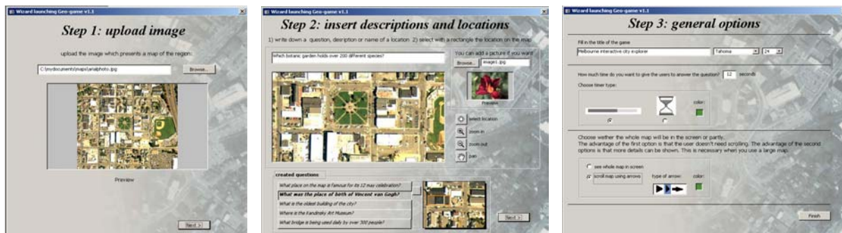
Fig 2. Only a few steps should be needed to create the game

With only one wizard a wide range of games are possible (Fig 3).