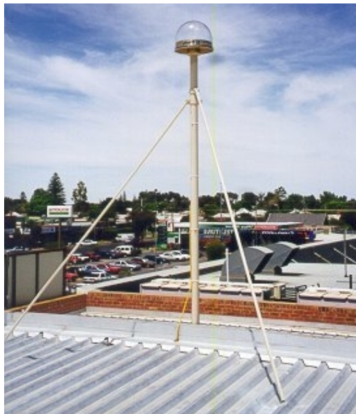
Figure 2: GPSnet Mildura

Ideally the GPSnet base station coordinates would be referenced directly to the AFN so that there is good agreement with the national framework. However, due to the sequential adjustment of GDA94 from the AFN down to the low order control there is generally a centimetre-level bias in the local ground control when compared to coordinates derived directly from the AFN. In some parts of the state this difference is 1-2cm and in others it is up to 15cm (Dawson, 2001). By referencing the GPSnet base stations to nearby ground control the local consistency of the datum is maintained. In time these biases, which are a legacy from traditional surveying methods, will be eliminated with the introduction of more satellite-based measurements into the datum realisation. In the meantime surveyors use ground control to verify base station coordinates and to fit constrain their results to the superseded reference frame AGD66. This datum is still used and will continue to be until all data sets are transformed to the new datum.