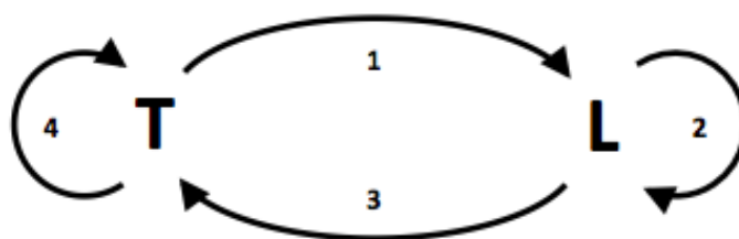
Figure 1: A simplified version of Laurillard's (2002) Conversational Framework

Two areas of educational research and development underpin this project: Diana Laurillard's (2002) influential conversational framework, and the field of learning design. Broadly speaking, the conversational framework proposes that the interaction, dialogue and feedback between teachers and students are critical to students' learning processes and outcomes. A simplified version of the framework is presented in Figure 1. A generalised learning interaction begins (1) when a teacher [T] designs and presents material or an activity to learners [L] who then engage with this by acting upon it (2). Learners subsequently respond to the material or activity given their current understanding (3), often directly to a teacher. This is then reflected and acted upon by the teacher (4) before a new loop or cycle is initiated in which the teacher may choose to re-present the material or activity, remediate or provide learners with feedback.