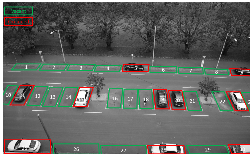
Figure 10.2: Image-based parking occupancy detection.

Imagery captured by cameras overlooking parking spaces can also be used to detect vehicles and determine the occupancy of parking spaces. This is commonly done by training a machine learning model using a set of training images and applying the trained model to the captured imagery to detect vehicles and parking spaces in real time. Determining the occupancy of parking spaces is significantly simplified if the field of view of the camera is fixed. With a fixed camera, an image can be manually segmented to delineate the parking spaces in a pre-processing step and the segmentation will remain valid for all the images as long as the field of view of the camera remains unchanged. In effect, this will reduce the vehicle detection task to a simpler image classification task. The trained model is applied to each sub-image corresponding to a parking segment and classifies it into one of two categories: vehicle or vacant. Using state of the art deep learning methods and convolutional neural networks the classification of sub-images can achieve accuracies as high as 99 % (Valipour et al., 2016; Acharya et al., 2018). An example of parking occupancy detection by classifying image segments is shown in Figure 10.2.