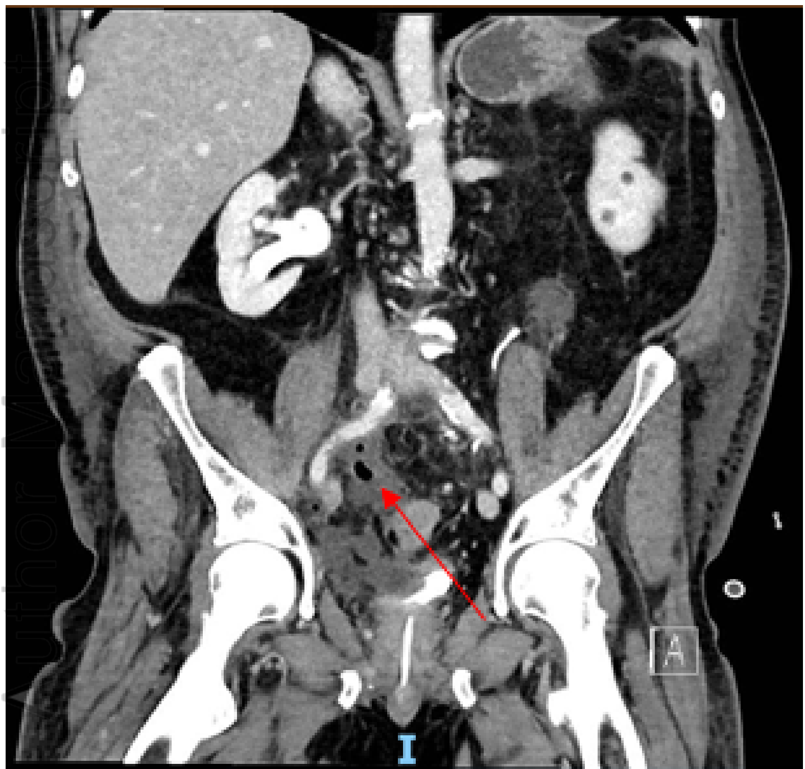
ANS_15734_Figure 2. Urinoma.PNG