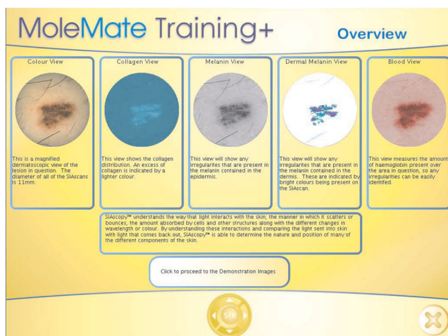
Figure 1 Overview of MoleMate™ training program showing 'Views'.

The program calculates a total score from the percentage of correct answers and the time it takes for each lesion to be assessed.