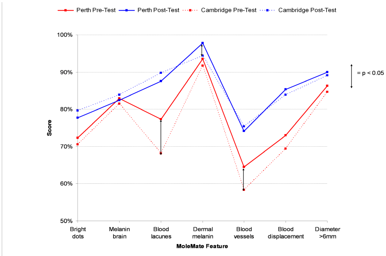
Figure 3 Pre-test vs Post-test scores by MoleMate™ feature: Perth vs Cambridge GPs.

Presumably, the Australian GPs scored higher than the English GPs on the pre-test because they had more general practice experience and more experience diagnosing PSLs.