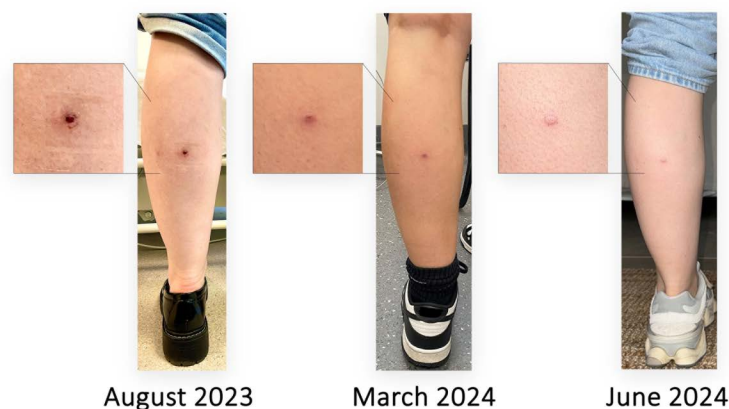
Fig 2. Focus group participant with a small (~3 mm) Buruli ulcer volunteered these images of their experience to demonstrate the clinical progress and scar formation of a small lesion diagnosed by punch biopsy, and was cured with 2 weeks of rifampicin/clarithromycin. The images were offered to demonstrate to candidate MuCHIM participants the expected progression and scar formation over time.

There is strong support for the role of public involvement in characterising the acceptability of clinical research [22]. We found that participants reported recognising the value of the research, particularly its role in testing candidate vaccines to prevent people from experiencing the 'worst-case scenario' in their community. Nevertheless, in the context of the risks