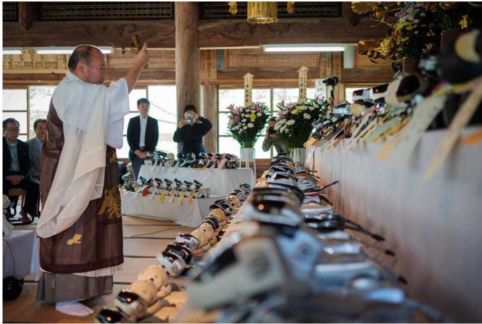
Figure 3. A Kofukuji priest performs kuyō for AIBO, 2018.

In May 2018, the 450-year-old Buddhist temple, Kofukuji, held a memorial service ( kuyō ) for over one hundred AIBO 'dog' robots (Figure 3). AIBO were produced by Sony from 1999-2006. Despite gaining a cult following, they never became commercially viable. In March 2014, Sony stopped producing replacement parts for the early models and many AIBO fell into disrepair and eventually 'died', despite efforts to crowdsource parts from 'donor' dogs (Robertson 2018: 164).