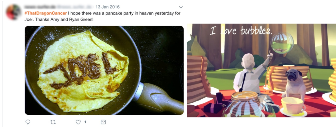
Figure 1: A tweet from the worldwide pancake party #ThatDragonCancer (left) and a screen shot from closing scene of the game That Dragon Cancer (right).

However, there is something in the error of recognition that reveals a very human quality. Through his father's lack of response, he is able to question his relationship within the technological system.