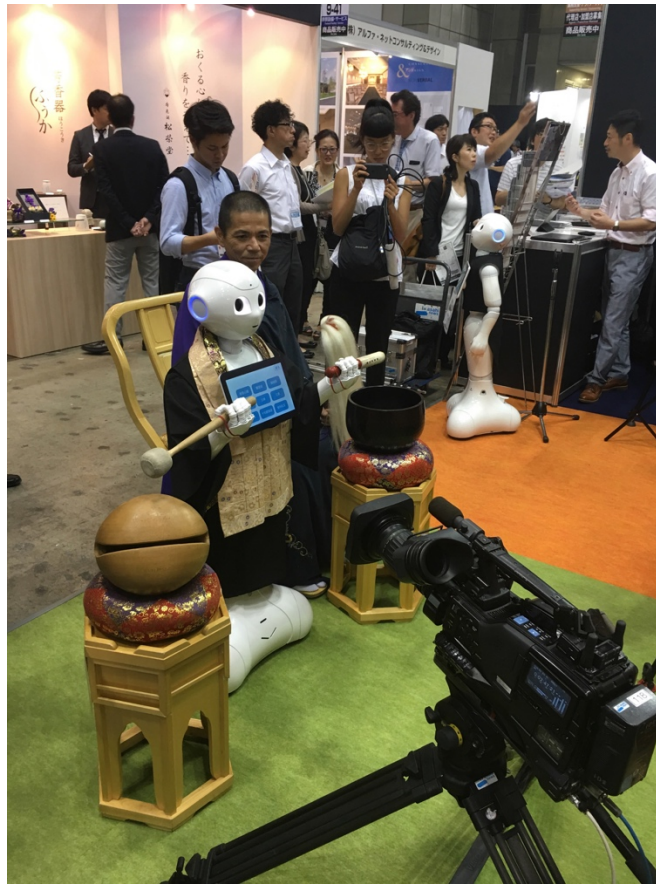
Figure 2. Pepper performs a demonstration funeral rite, Tokyo, 2017.

patterns and facial expressions. Dressed in silk robes with a mallet strapped to one arm, Pepper performed excerpts of the Heart Sutra, striking a large bell and wooden block in time.