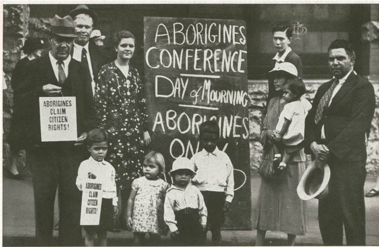
Figure 2: “Aborigines day of mourning, 26 January 1938,” Q 059/9 Mitchell Library (Printed Books Collection). 40

From the 1930s, there was a marked rise in organised Aboriginal political activity in south-eastern Australia. This included the formation of the Aborigines Progressive Association and the Australian Aborigines League, marked by key protests such as the Day of Mourning in Sydney in 1938 and the Cummeragunja Walk-Off in 1939. Leaders such as Bill Ferguson and William Cooper drew on a range of broader political discourses of rights to campaign for land rights, political representation, and the vote. Cooper's protest against the Nazi government of Germany was likely intended to also draw attention to the persecution of Aboriginal people by Australian governments. 37 In the post-war era, as the atrocities of the Holocaust contributed to growing awareness in Western societies of the dangers of racial discrimination, Australian governments and society became increasingly uncomfortable about the position and treatment of Indigenous people. While there were some moves to extend greater citizenship rights to Indigenous people, increasing unfavourable international interest in the rights of Indigenous people contributed to state and federal-level debates over citizenship rights, including the vote. 38 At the same time, a policy shift occurred—at different times in different states—towards the cultural and economic assimilation of Indigenous people. 39