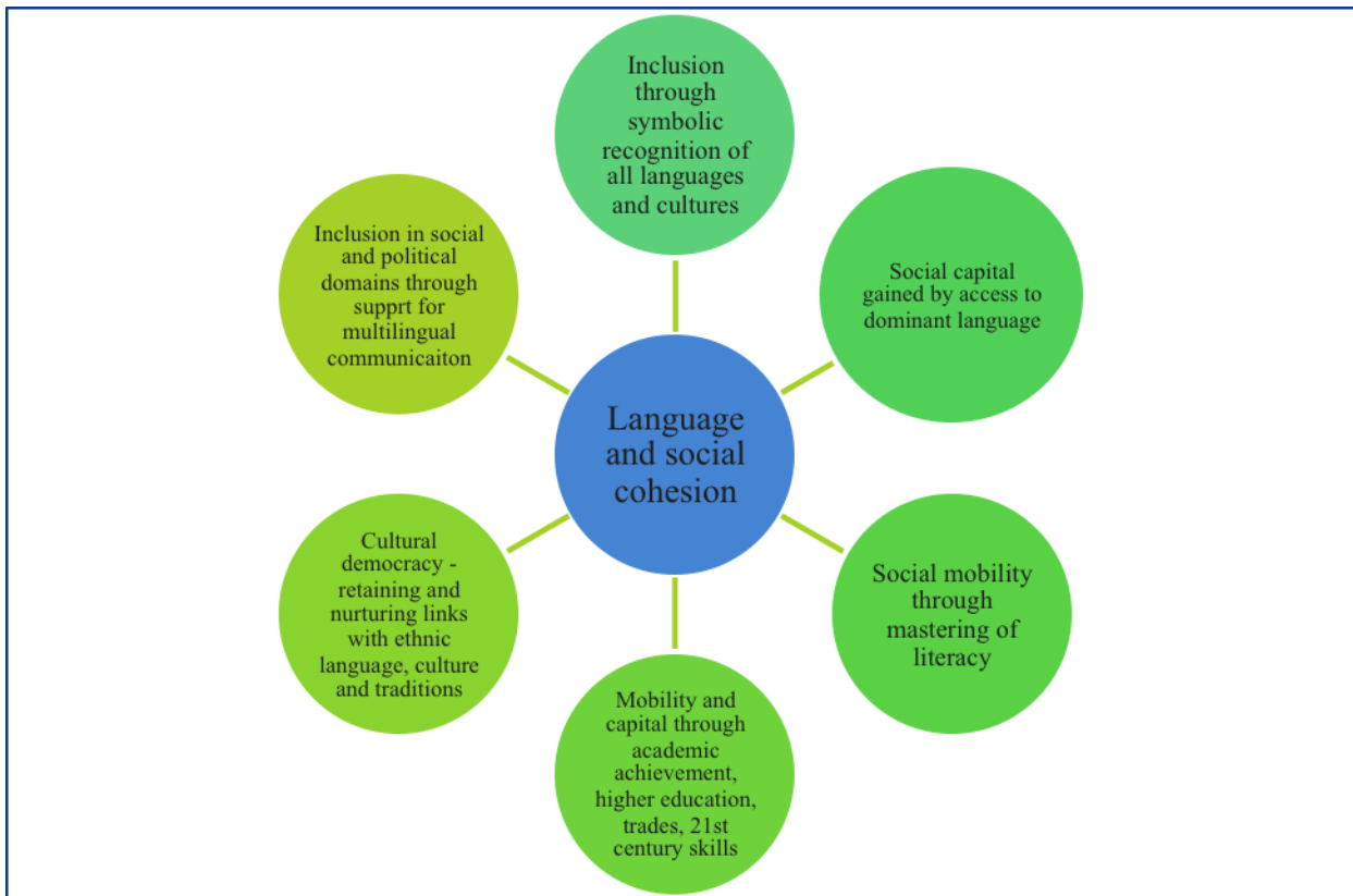
Figure 3: Facilitating links between language and social cohesion (UNICEF, 2016c)

In summary, LESC has found that language can be a driver of conflict in multiple ways, some evident, others camouflaged. Because language is linked to identity, it is part of the emotional and symbolic world of ethnic groups. Language is tied to the national identity of countries and so majority communities demand that minority groups learn official languages. But language is also a practical and material resource. Children develop literacy, numeracy and educational skills by learning academic language. Specialised language enables adults to enter trade, occupational or professional fields. Language is used to build national identities, which can exclude or include people. However, when engaged with through collaborative, democratic-based processes, language-related tensions can be relieved.