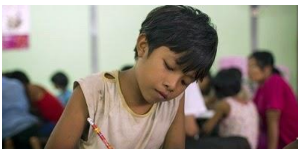
Photo 1: A boy studies in Myanmar. UNICEF is running a Quality Basic Education Programme with support from Australia, Denmark, EU, Norway and UK

Most recently, under the Sustainable Development Goals (SDGs 2015-2030), Goal 4 strives to preserve these rights by ensuring 'inclusive and equitable quality education and promote lifelong learning for all', including 'safe, non-violent, inclusive and effective learning environments for all'. Closely connected is Goal 5, to 'Achieve gender equality and empower all women and girls' and Goal 16, which aims to 'Promote peaceful and inclusive societies for sustainable development, provide access to justice for all and build effective, accountable and inclusive institutions at all levels' (UN, 2015).