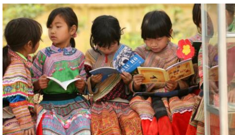
Photo 2: Girls from an indigenous community, Viet Nam.