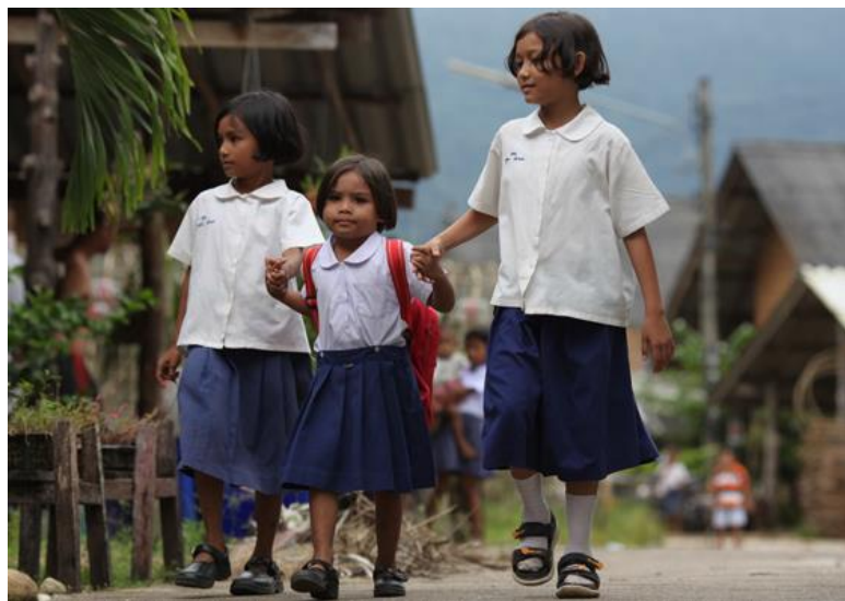
Photo 4: Siblings walk to school at Ban Triem Early Childhood Development Centre in the town of Ban Triem, Kuraburi District South of Thailand.

Activities were mapped to specific subject areas and an explicit learning element within the curriculum. Such a curriculum exercise represents important groundwork in creating a dialogue around difference and how it is represented and engaged with in education systems. This achievement of the LESC Initiative is available as a model for application and adaptation to other settings.