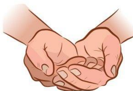
Figure 2. Advantages of mother tongue-based multilingual education.

An additive multilingual approach means that language and literacy skills are strengthened in more than one language e.g. mother tongue plus national language plus language of wider communication