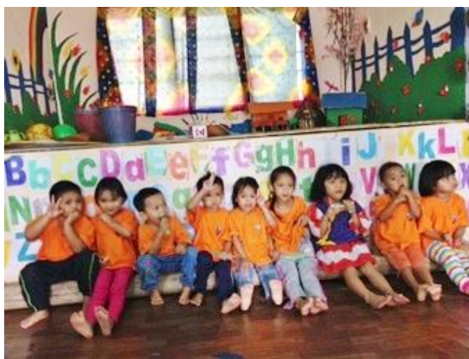
Photo 5: Dayak Bidayah Bilingual Preschool, Sarawak, Malaysia, 2014.

One key solution for national development challenges and for children’s rights in education is the implementation of or scaling up of multilingual education programs. This is applicable for all parts of the Asia Pacific region. The crucial first step is to recognise that mother-tongue learning is a key factor in addressing educational inequality - by refusing to gloss over it as ‘too hard’ because it presents challenges. The next step is to try and move towards a consensus on MTB-MLE that takes into account all key stakeholders in communities, and eventually, in whole societies. As the central authority in education systems, governments play an essential role in recognising the importance of MLE in improving educational outcomes for minority children and in garnering support from across other key stakeholders and community groups. Partners such as UNICEF and the Asia Pacific Multilingual Education Working Group (MLE WG) can play a key supporting role in providing information, support and training on MLE. While this is a complex and difficult process, the results of ignoring the importance of mother-tongue learning will cause more problems than attempting to incorporate it into education systems in the long run. Fostering inclusion through recognition of differences bolsters political and social cohesion.