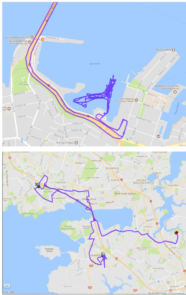
Fig. 3 GPS tracks of two participants

downloaded after the end of the data collection session. Subsequently, as with accelerometer wear, GPS data collection was reduced to one day – a day selected by the disabled young person that illustrated community participation.