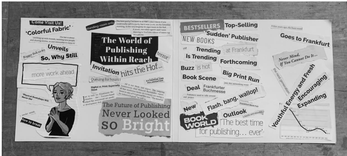
Figure 3: Collage Made from Industry Newsletters at the 2019 Frankfurt Book Fair

A transition to hard buzz is also effected through press releases: particularly those produced by the Frankfurter Buchmesse itself. We saw this in action during our time as Penny Powers and Polly Pringle, journalists. Using these alter egos, we attended the official opening press conference of the 2019 Buchmesse. 5 The speeches we heard held forth on the health of the book industry, the rise in audiobook sales, and the growing role of AI: all key messages in describing the shape of book culture and its areas of future profit-making. In Germany, too, there are additional routes for information from the Fair to reach the public, including radio programs, public attendance, and associated events. Such mechanisms contribute to the general buzziness surrounding the Buchmesse and the industry, though not so much to buzz around individual titles.