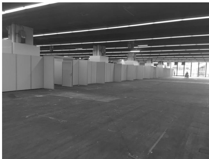
Figure 8: Behind the Scenes at the Buchmesse

In this section of the chapter, we consider the less public face of the Buchmesse. We explore non-displays and quietness, shrinking space and emptiness. And we look at informal spaces, accessible only through dérives , happenstance and privilege.