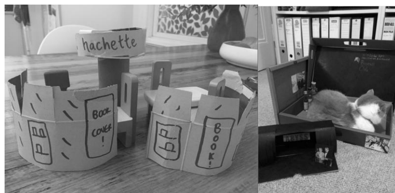
Figure 6: Prototypes of our Buchmesse Model

The aim of our experiment was to use the process of making (and playing with) a miniature, cardboard book fair to reflect upon physical elements and experiences at Frankfurt. Our equipment included cardboard, rulers, Stanley knives, scissors, glue, rubber bands, and assorted found items. Using photographs and our memories of the Buchmesse in 2017 to guide us, we initially made prototypes of different elements of the Fair, including a doll's house-sized version of the Hachette stand (including its panopticon); and a cat-sized version of the Business Club (Figure 6).