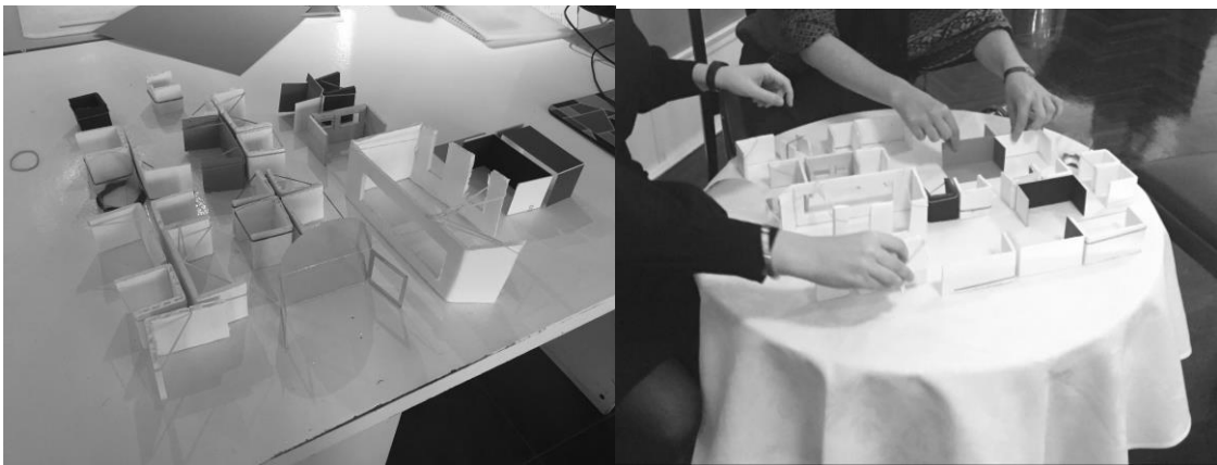
Figure 7: The Cardboard Buchmesse in Action

Some of our reflections while making the Cardboard Buchmesse included scale; we made one deliberately overlarge stand to gesture at the unequal sizes we had observed. Discussions during our construction phase included the observation that large stands of multinational publishers were ‘both closed and open, emotionally speaking’, and one of us wondered whether we should make them ‘castellated, with potential for boiling oil to be poured from the ramparts.’ The experimentation with custom designs and unique fit-outs was sometimes frustrating—at one point one of us threw a model stand into the air—but also produced intriguing objects.