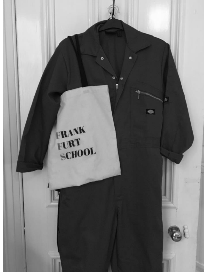
Figure 10: Custom FFS Tote, with Non-actualised Boilersuit

The bags turned out to be conversation starters that could be read in two ways. On the one hand, FFS to the astonishing oversupply of books revealed at the Fair. (We also thought about printing stickers indicating which books we thought superfluous to requirement, but decided against this, due to previous professional experience of sticky residue, and because it probably wouldn't have been received favourably by exhibitors.) On the other hand, FFS to curmudgeonly male theorists who associate a negative vision of mass culture with women, perpetuating gender-based discrimination (see Driscoll 2019 for more).