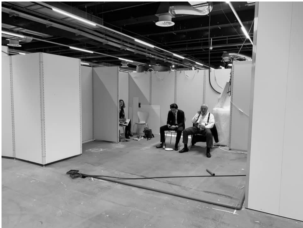
Figure 9: Publisher’s Stand Reversed, with Uninvited Visitors

The hidden zone in Hall 6 inspired us to set up a Publisher’s Stand Reversed in 2019 (see Figure 9). We noticed a nook formed by the reverse of panels from a legitimate stand, and two chairs nearby. We dragged these into the nook, and placed a copy of our self-published autoethnographic comic erotic thriller, The Frankfurt Kabuff (Squiscoll 2019a), prominently between some plaster offcuts. At first, we simply sat and relished the quiet of the space and the respite from constant socialising. The Buchmesse is full of people seeking an opportunity to privately collect their thoughts (we later noted others using the hidden zone for moments of rest). Soon, we commenced Ullapoolist activity. We read through the industry newsletters we had collected, and began ripping out words to form collages that represented each day—a key step in our processing of buzz-generation at Frankfurt, as discussed in Chapter 1. We fell short of arranging meetings at ‘our’ stand (although we were tempted, especially at the thought of giving directions to people), but continued to use it every day of the Fair, a ritual of belonging and attachment that reflectively activated the Buchmesse’s negative spaces.