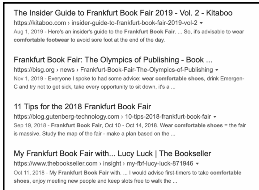
Figure 5: Top Results of a Google Search for ‘Frankfurt book fair comfortable shoes’ (3 December 2019)

If you tell a publishing industry insider that you are going to the Frankfurt Book Fair for the first time, they will probably advise you to wear comfortable shoes. Indeed, a Google search for ‘Frankfurt book fair comfortable shoes’ yields over 3.3 million hits (for the top hits, see Figure 5).