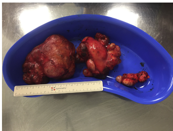
Figure 2 Photo of resected mesenteric lymph nodes. The largest was 165 mm in width.

Various theoretical mechanisms of mesenteric spread have been proposed, including serosal deposits invading the bowel via transperitoneal seeding, direct infiltration of nodes at the root of mesentery and embolic haematogenous spread [6]. Gastrointestinal tract (GIT) metastases from testis have been reported more frequently than mesenteric nodal metastasis in the literature. Sweetenham et al. [7] identified six cases of GIT metastases from primary testicular carcinoma. These authors attributed three cases to direct extension from retroperitoneal lymphadenopathy and the other three to haematogenous spread. A larger series of 487 GCTs suggested the rate of GIT metastases was