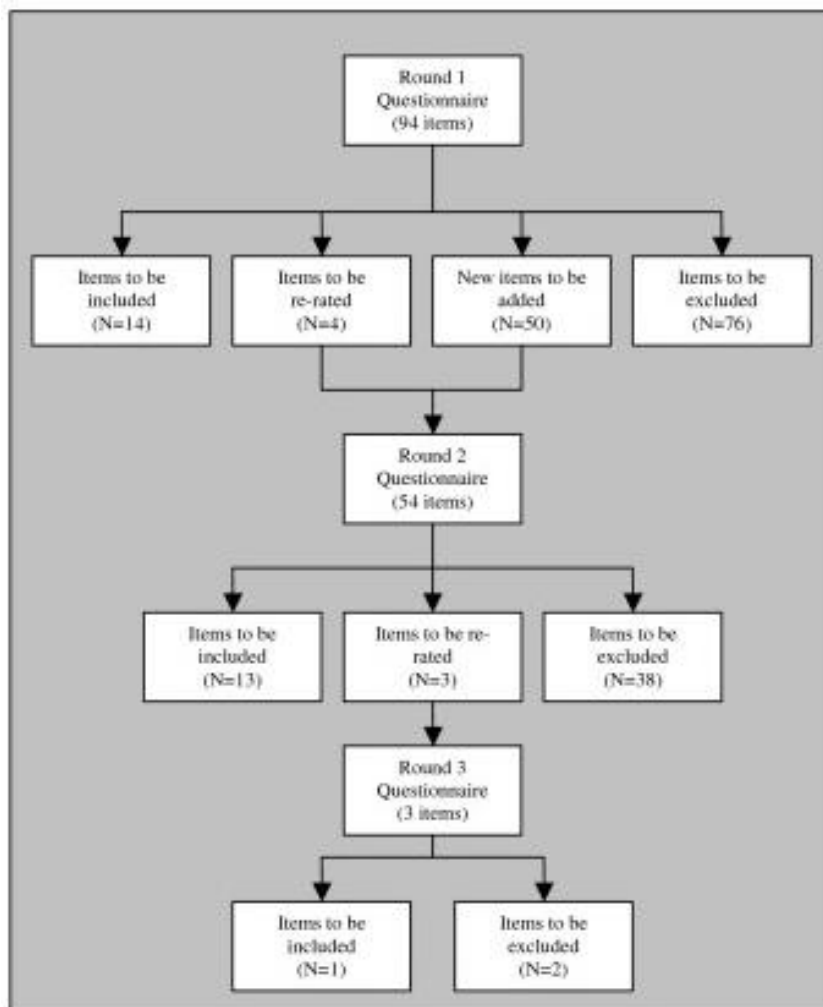
Figure 2 Items accepted, rejected and re-rated at each round.

Papers which described interventions to decrease the severity or duration of a panic attack, or offered suggestions about when to recommend professional help, were reviewed, giving a total of 37 papers. Most of the advice given in these papers was very clinically oriented, or required extensive training to be applicable. For example,