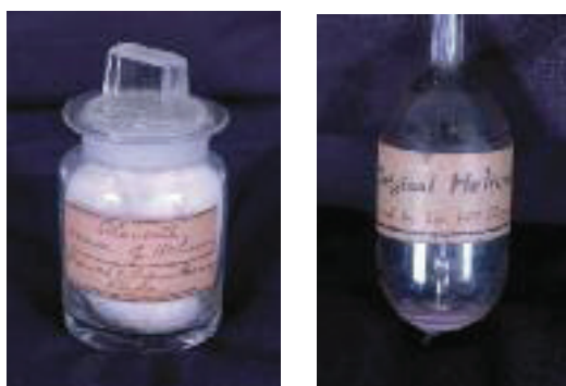
Figure 2. Cleveite sample and helium in a discharge tube (presented by Sir William Ramsay). Cat. nos 155a & b, School of Chemistry Collection, University of Melbourne.