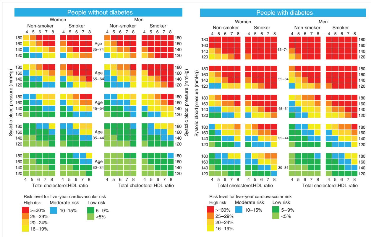
Figure 2. Five-year cardiovascular risk charts based on the recalibrated Framingham model.

This chart is based on 2008 Framingham model that has been recalibrated using information on Aboriginal and Torres Strait Islander participants from the Well Persons Health Check study, which recruited people from 26 remote communities from Far North Queensland. It has not been validated for use in other Indigenous populations.