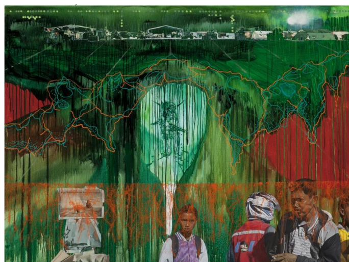
Figure 5. Lyndell Brown/Charles Green and Jon Cattapan, Spook Country (Maliana) , 2014, oil and acrylic on linen, 185 × 250 cm. Private collection.