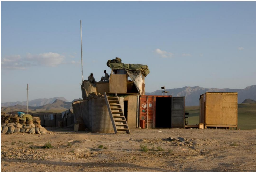
Figure 6. Lyndell Brown and Charles Green, Afghan National Army Perimeter Post with Chair, Tarin Kowt, Uruzgan Province, Afghanistan, 2007–2008 , editioned digital colour photograph, inkjet print on rag paper, 111.5 × 151.5 cm. Collection National Gallery of Victoria. Courtesy: ARC One Gallery, Melbourne.

Few have defined the diffuse spatiality of the post-modern battlefield better than Australian War Memorial curator Warwick Heywood: