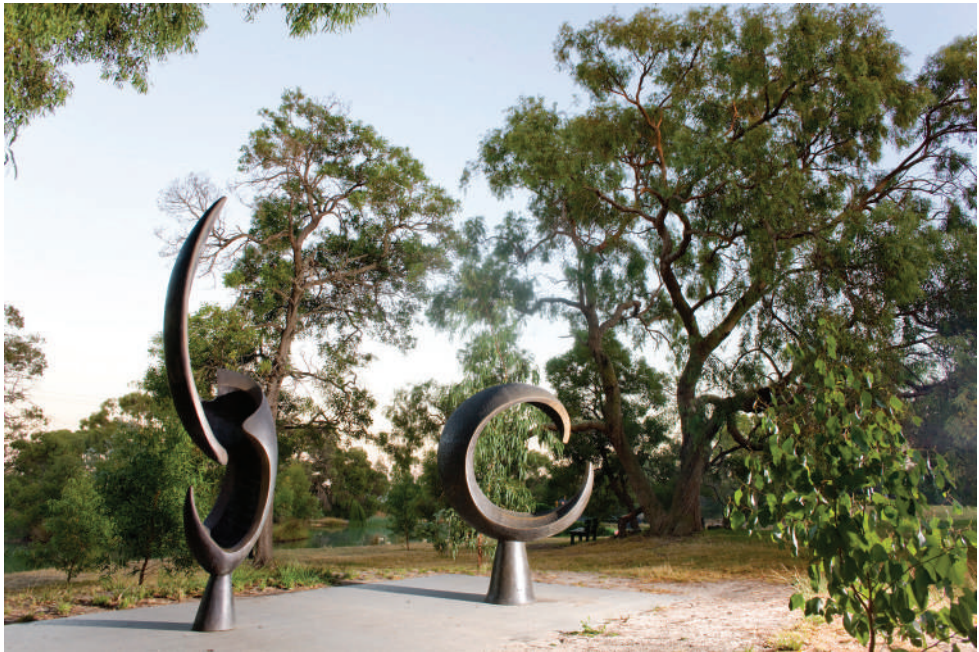
18, Teisutis Zikaras, ETA fountain , (left), 1961, cast 2009, bronze, 340.0 × 87.0 × 64.0 cm, McClelland, 2009.01, bronze cast commissioned by Elisabeth Murdoch Sculpture Foundation, 2009, to commemorate the 100th birthday of Dame Elisabeth Murdoch AC DBE, and GPO fountain (right), 1964, bronze, 200 × 150 × 75 cm, McClelland, 1993.74, gift of Australia Post, 1993

as part of a Council of Adult Education and VSS exhibition, ‘Sculpture Today’ (1960), before featuring at the inaugural Mildara Prize for Sculpture at Mildura Art Gallery (1961), and finally being sent to the Musée Rodin in Paris as part of the Australian national representation at the ‘2e Exposition Internationale de Sculpture Contemporaine’ (1961). Figure is a strangely totemic form; its single ‘Cyclops’ eye and semi-spherical halo create the aura of an object designed to be venerated and treated with some caution. However, these sorts of readings are absent from reviews at the time. In each instance, Figure was accepted simply as a work of high modernism, representing the most advanced sculpture then known in Australia.