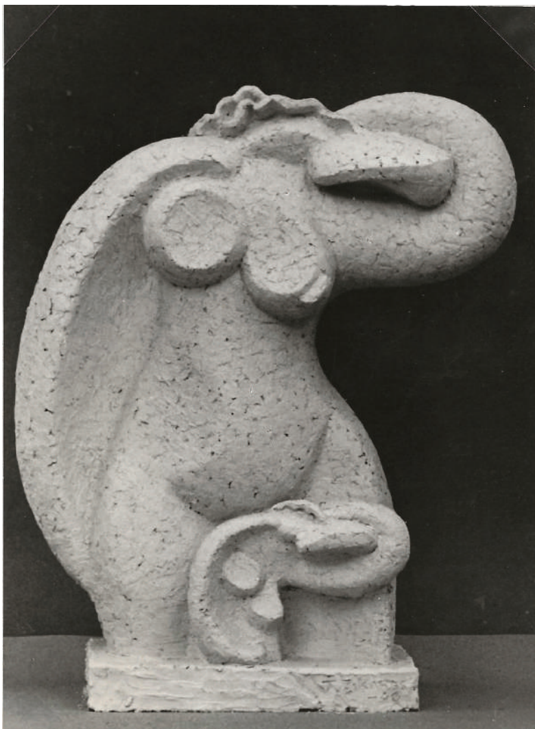
9, Teisutis Zikaras, Gemimas, Birth , 1948, photo: Photopress Bilderdienst, Artur Hindrichs, Heidelberg-Schlierbach, courtesy the artist's estate, Melbourne