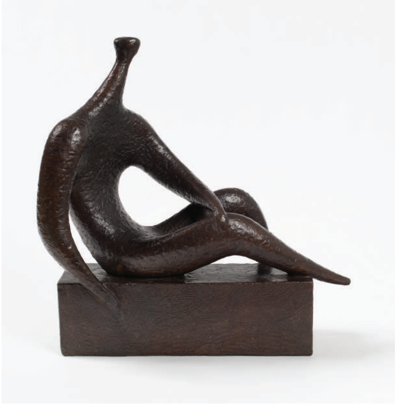
13, Teisutis Zikaras, The Swimmer , 1955, cast 2009, bronze, 40.0 x 40.0 x 14.0 cm, McClelland, Langwarrin, 2011.51, donated through the Australian Government's Cultural Gifts Program by Roderick Macdonald, 2011

figures, and the textured surface, a remnant of Mikénas's technique of pressing small discs of clay onto the surface, to disrupt any illusion of flesh, together mark the body as distinctly modern. The commission ultimately went to the painter Leonard French for a mural design that owed much to Fernand Léger and French Cubism. Nevertheless, the same firm of architects engaged Zikaras for another major commission at the University: a series of eight cast concrete panels for Union House (1957–1958, fig. 14). The architects required eight balcony panels that would screen the upstairs dining hall from sunlight while contrasting