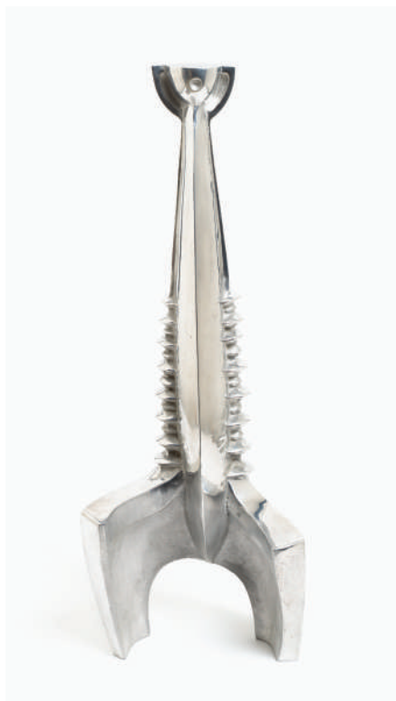
17, Teisutis Zikaras, Figure , 1959, aluminium, cast and polished, 64.0 × 24.0 × 18.0 cm, National Gallery of Australia, Canberra, 72.40, purchased 1972

Figure (1959, fig. 17) provides a case in point. The work depicts a female form that has been dramatically reduced to a central armless shaft, with protruding ribs and straddled legs. It was almost certainly included in 'Six Sculptors' and afterwards toured among regional Victorian galleries