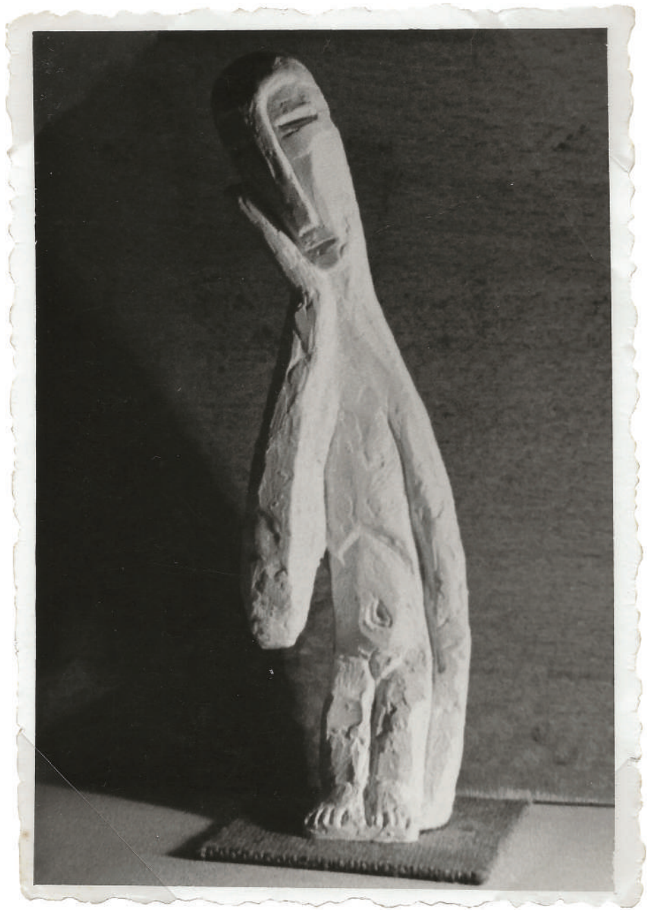
10. Teisutis Zikaras, Smūtkelis, Christ in distress , 1951