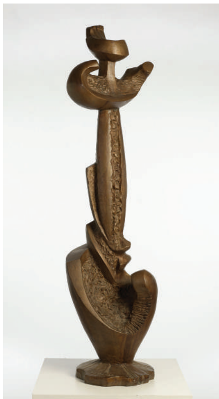
19, Teisutis Zikaras, Mecanus , 1960, bronze, 148.0 × 38.0 × 37.0 cm, private collection, courtesy Menzies Art Brands

Despite the abstract idiom employed for public sculpture, throughout the 1960s Zikaras's studio work remained based on figuration. Mecanus (1960, fig. 19), which was first exhibited at the Herald Outdoor Art Show