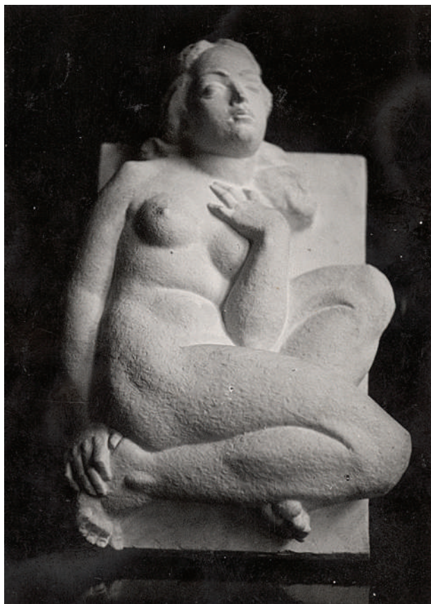
4. Teisutis Zikaras, Mergina , c.1942, photo courtesy Juozas Zikaras Museum ZA 347

the contours of the rectangular block. The dimpled surface reflects the adoption of Mikėnas's technique of pressing discs of clay over the entire surface of the sculpture. Similarly, a life-size allegorical figure holding a sheaf of flax, Linas (Flax, c.1942–1943, fig. 5), represents a centuries-old staple of Lithuanian agriculture and its associated cosmology. Her impassive gaze and immense volumetric forms clearly reference Mikėnas's