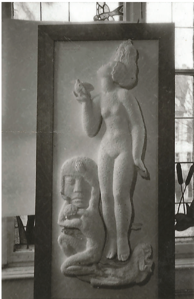
8, Teisutis Zikaras, Taikos Siekimas, Pursuit of Peace , 1947