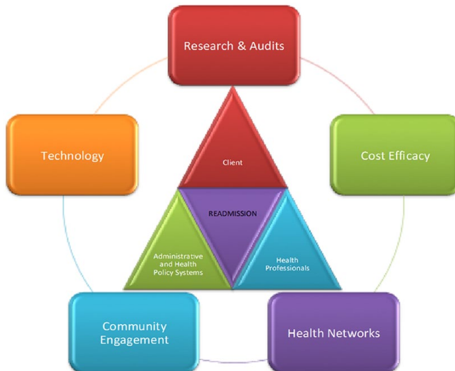
Figure 2. Models for closing the gap. To address an outcome measure such as readmission requires arms of the health systems, which are often compartmentalized into silos, to overlap with common purpose. In answering, 5 key areas should be addressed: (1) defining the health jurisdiction from which most of the clients reside, (2) engagement of that community and its primary health infrastructure, (3) investing in technology to bring the gaps and address resource issues, (4) equipped for internal audits and aligning with partners to engage novel research, and (5) delivering these services at an acceptable cost.