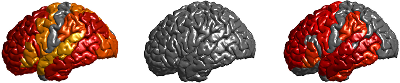
FIGURE 3 Summary of the cortical thickness effects in adult OCD patients compared to healthy controls in ENIGMA-OCD, in relation to medication status (based on Boedhoe et al., 2018 Am J Psychiatry). Negative effect sizes d (ranging from light orange d = -0.05 to dark red d = -0.15 ) indicate thinner cortex in OCD compared to controls

medicated OCD (n=646) vs unmed. OCD (n=831)