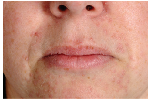
Figure 2 An example of the papulopustular (acneiform) rash experienced by some participants in response to treatment with oral gefitinib. The rash is most prominent in areas exposed to UV light, i.e. the face, neck and décolletage.

All participants promptly resumed their menstrual cycles (i.e. within 6 weeks of cure), and 3/8 so far have achieved a subsequent spontaneous