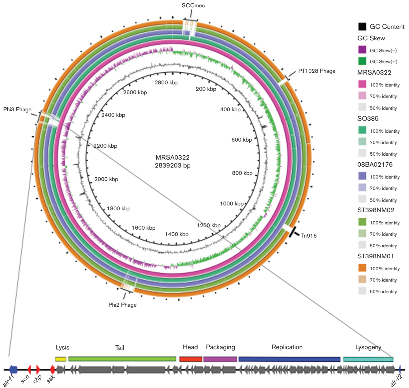
Fig. 1. Sequence comparison of representative genomes of CC398 S. aureus , illustrating a high level of sequence conservation amongst the CC398 lineage. Genomic regions in NZ15MR0322 that were variably present in other CC398 S. aureus include the SCCmecV mobile element, and two complete phage regions ( \phi Sa2 and \phi Sa3).

associated with ‘re-adaptation’ to humans [7], and may facilitate sustained human-to-human transmission of CC398 LA-MRSA, an observation currently rare within this clone. It is therefore of concern that a recent NZ CC398 MRSA, clustering with isolates associated with livestock or livestock exposure, has apparently re-acquired an MGE associated with human immune evasion, and suggests possible evolutionary adaptation to human infection within NZ.