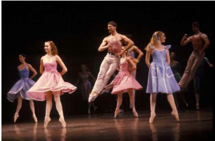
Figure 4: Walter Stringer, Artists of the Australian Ballet in The Display , 1983. Transparency. Courtesy of the National Library of Australia, PIC/6558/1582.

In complete contrast, The Leader and his pack visually formed the menacing body of a gang onstage (Figure 5), wearing high-waisted denim jeans or overalls, many rolled up at the ankle, with a mix of cotton singlets and tee-shirts. The overalls had studded pockets and jeans were fastened with studded leather belts, with jazz shoes purpose-coloured to look like runners. In thick, natural fibers, a palette of muted tones and the addition of head and armbands, the men epitomized youth street culture. The Leader's jeans and singlet were terracotta red as was the strip of fabric bound around his left upper arm, and his jeans featured a line of silver studs down each leg. His singlet was pulled low, the dark red highlighting skin and muscles across his chest and shoulders; here, 'these men embodied their sex and, by assumption, their country' (Card, 1999: 87).