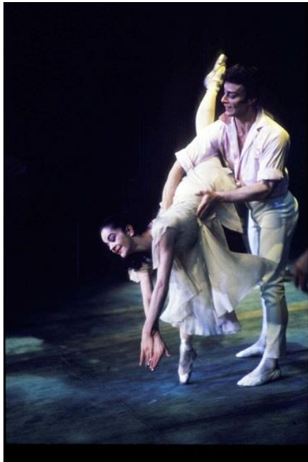
Figure 1: Walter Stringer, The Female and The Leader , 1964. Transparency. Courtesy of the National Library of Australia, PIC/6558/1530.

1965: 127). The women spent their time grouped as an audience for the men's display of sporting prowess.