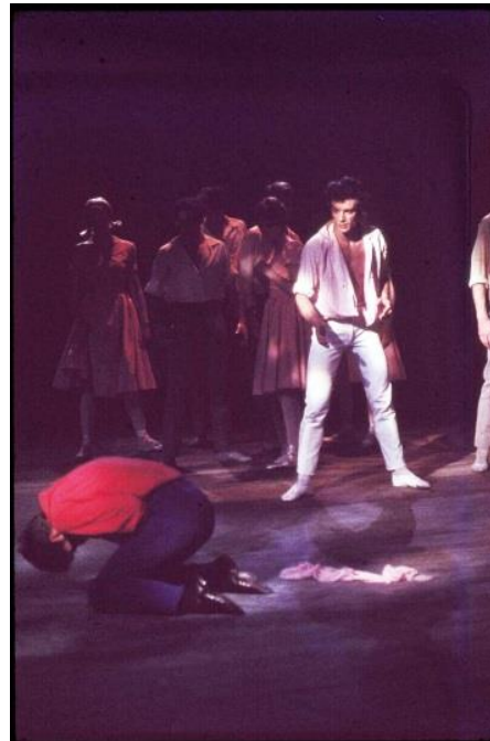
Figure 2: Walter Stringer, The Leader attacks The Outsider , 1964. Transparency. Courtesy of the National Library of Australia, PIC/6558/1533.

The Leader's appearance was similar to his gang except for the colouring. Unusually for a man in 1960s Australia he wore a pink shirt, and was otherwise entirely in white. When read against Helpmann's tangled past with the Aussie mob, The Leader's costume indicates how the work 'mercilessly sends up the bullies' and 'mocks a sports-mad nation' (Vincent, 2012). Helpmann told of a time near Sydney's Bondi Beach in the early 1920s when he wore, amongst other flamboyant items, a pink shirt. A group of local lads took such offense to his appearance they picked him up and threw him into the ocean. One account even specifies the lads as lifesavers (Philpott & Forbes, 2016), a national symbol of identity. In the build-up to his violent encounter with The Outsider , The Leader performs a parody of the famous Sleeping Beauty rose adagio. Spinning along a line of four mates, The Leader stops at each to receive, instead of a rose, a bottle of beer from which he drinks. The image of this 'gang-leader', by now rather inebriated, dancing the role of a princess dressed in pink and white, undermines the power of the dominating masculine image, the sports star.