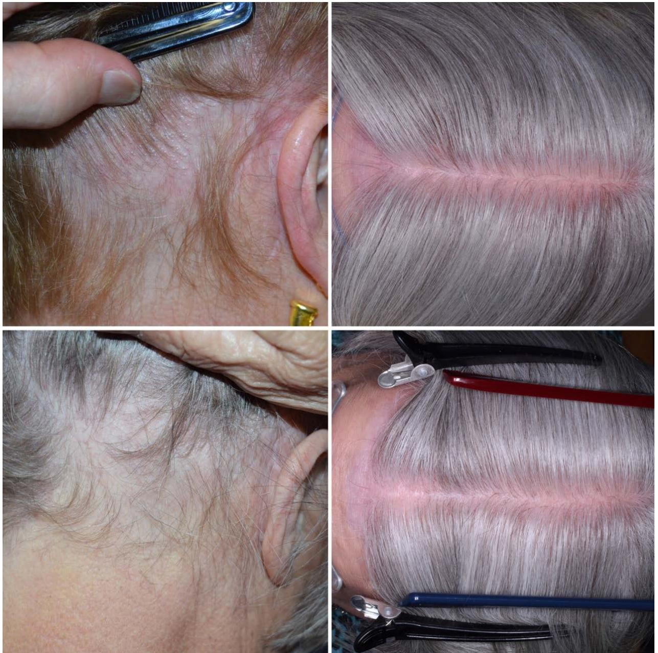
Figure 3: Right occiput (top left) and mid-scalp (top right) with marked erythema prior to tildrakizumab therapy. On the bottom, clinical improvement after six doses of tildrakizumab.