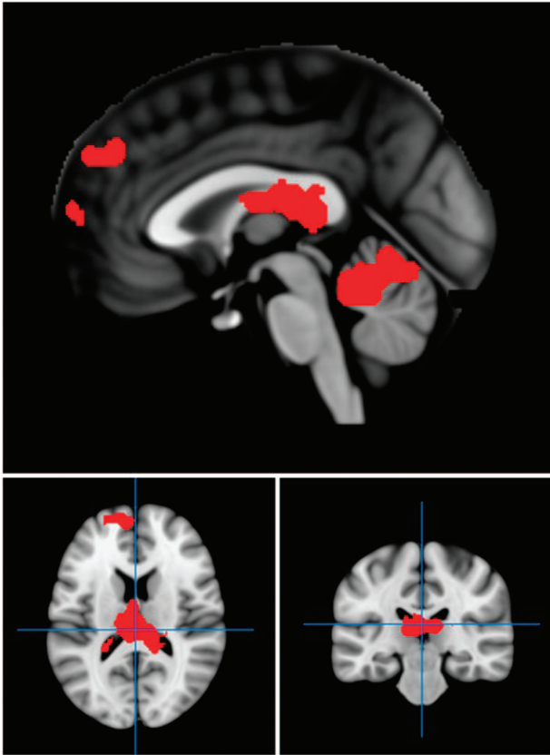
Figure 2. Regions of activation in medial frontal gyrus and cerebellum which correlated significantly with childhood physical abuse, as assessed by the CTQ, in those with borderline personality disorder. Red areas show activation meeting threshold P < 0.005 across whole brain, superimposed on the mean T1 image. CTQ, childhood trauma questionnaire.

to the cuneus. However, within the BPD group, a strong relationship was observed between childhood experiences of physical abuse and greater activation of the midbrain, medial frontal gyrus, pulvinar and cerebellum to emotional stimuli. Midbrain activation to emotional faces was additionally correlated with severity of current psychotic symptoms, especially persecutory beliefs. These results support an association between childhood trauma and long-lasting changes in brain responses to emotional stimuli. Although it is not possible to ascertain from the current study whether this effect is specific to BPD, such changes may contribute to the development of psychotic symptoms in adulthood, particularly at times of negative emotional stimulation.