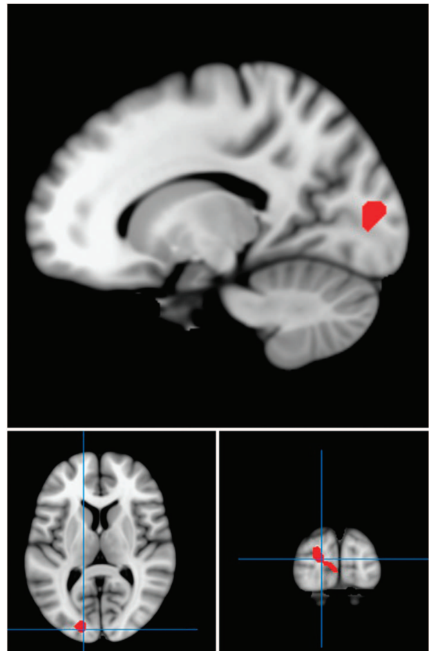
Figure 1. Regions of statistically greater activation in the right cuneus in the control group compared with the borderline personality disorder group, in response to fearful versus neutral faces. Red areas show activation differences meeting threshold P < 0.005 across whole brain, superimposed on the mean T1 image.

Abbreviations: BPD, borderline personality disorder; CTQ, childhood trauma questionnaire; HAM-D, Hamilton Rating Scale for Depression; IQ, NART IQ; OCD, obsessive compulsive disorder; PANSS above baseline, PANSS positive symptom score above counting lowest rating as 0 not 1; PTSD, post traumatic stress disorder; ZAN-BPD, Zanarini Borderline Personality Disorder Symptom rating scale; YMRS, Young Mania Rating Scale.