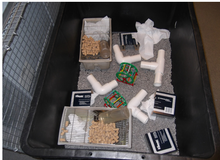
Figure 1. Environmental Enrichment cage setup. Setup shows the refuges, exercise wheels, and tunnels in the environmental enrichment cage.

The black low density polyethylene plastic EE cage (Plastime, Castegnero, Italy) measured 81 cm (length) × 57 cm (width) × 34 cm (height) internally, and had a wire cage lid (Figure 1). It was stocked with the following stimulatory equipment: 2 exercise wheels, 3 PVC plumbing elbow pipes (2.54 cm diameter) bent at 90°, a 2.54 cm plumbing T-piece, 2 standard cages with holes drilled in their sides to allow mouse access and with tissues inside and pellet food provided