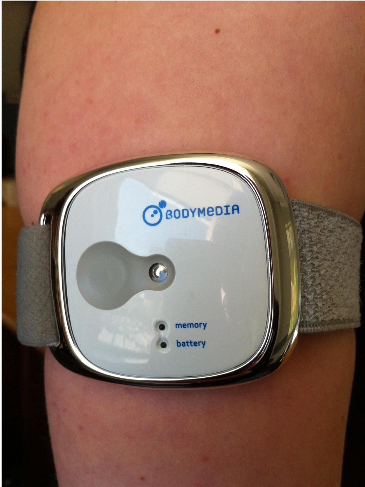
Figure 1. The BodyMedia SenseWear armband as worn.