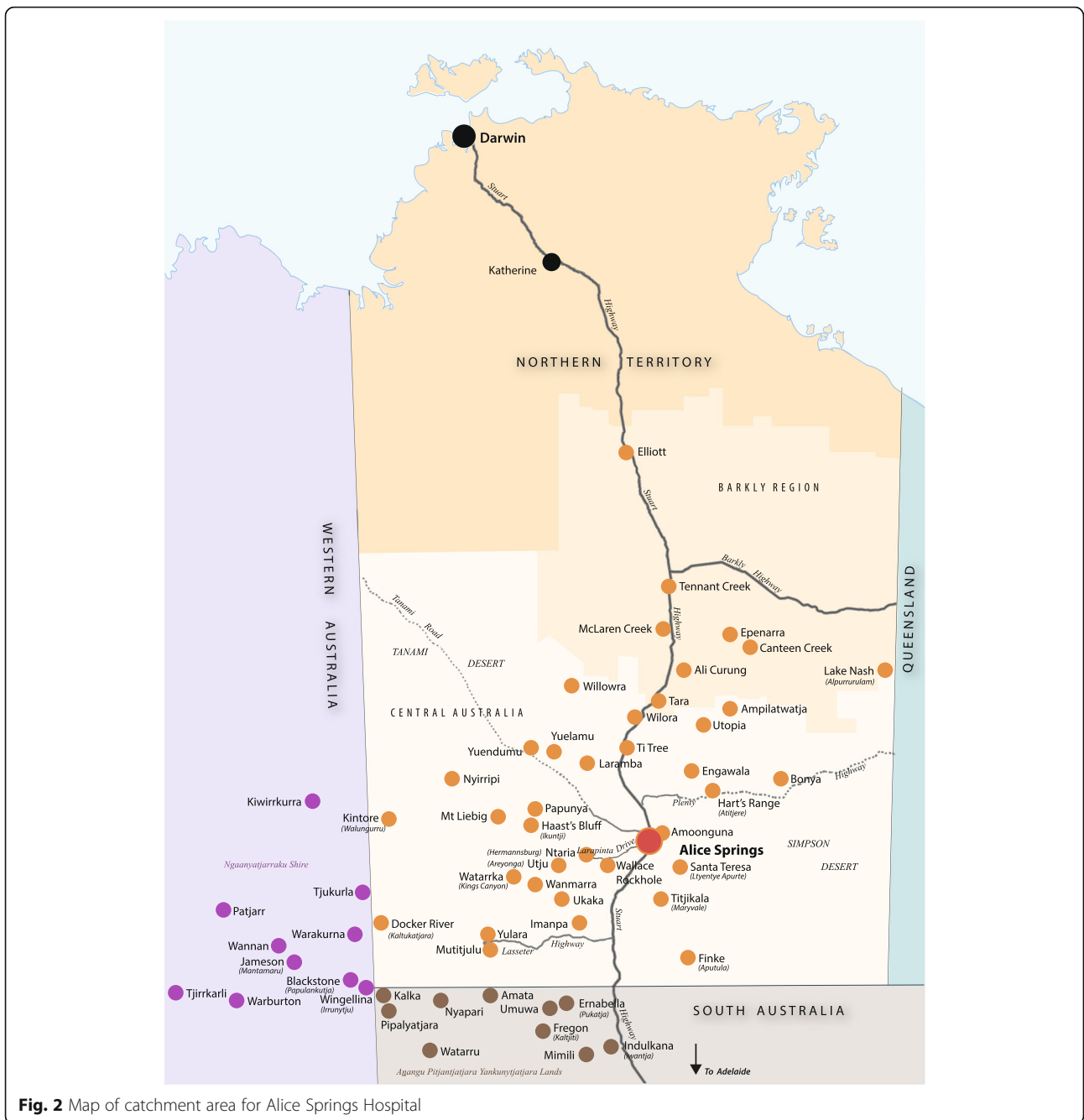
Fig. 2 Map of catchment area for Alice Springs Hospital