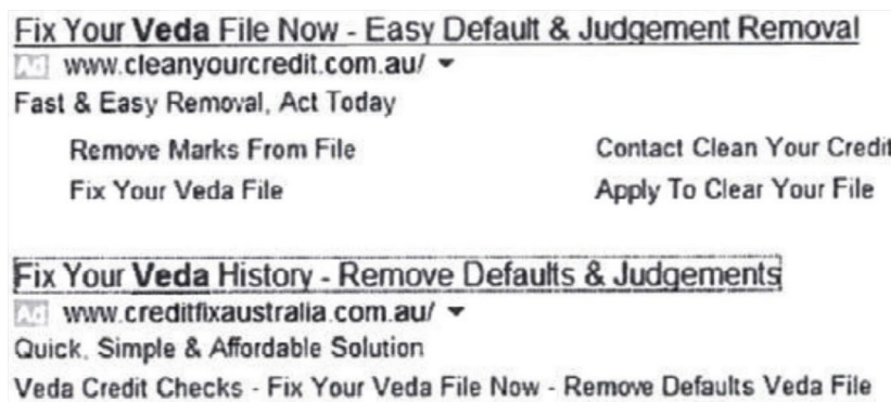
Figure 21.2 Veda Google advertisement

A similarly fact-specific approach to keyword advertising and trade mark use has been adopted in Australia. In Veda Advantage Ltd v Malouf Group Enterprises Pty Ltd , 44 a Federal Court decision from 2016, the plaintiff was a data analytics company that provided credit reports to lending institutions, and was the registered owner of VEDA for financial services. It brought infringement proceedings against a party that had purchased Google AdWords containing the term 'veda', which were used to generate advertisements for its credit repair services, some of which also used the term 'veda'. An example of the defendant's advertising is set out in Figure 21.2.