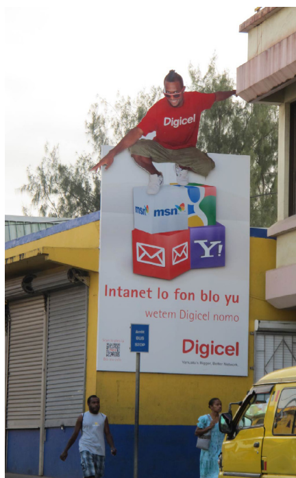
FIGURE 1. Publicity billboard for internet access via mobile phones (Port Vila, June 2011).

We can expect to see mobile phones taking over functions of portable computers in remote locations and so should also plan on building access to cultural collections using these technologies. The development of mobile phone dictionaries of small languages based on common formats of lexical databases (see, for example, the PARADISEC project Wunderkammer) can already provide online or local access to electronic dictionaries with sound and images. Similarly, new methods of streaming digital media allow for efficient delivery of ethnographic recordings over low bandwidth, including mobile phones. The PARADISEC project EOPAS streams audio or video recordings of stories over the internet together with text (see the discussion below) using HTML5 and open-source media. HTML5 is an emerging web standard that allows streaming of multimedia within the standard web page, thus obviating the need for users to install additional software or plugins (Pfeiffer 2010). All of this indicates that creating proper forms of recordings, images and so on that conform to accepted archival standards will allow them to be transformed into delivery formats appropriate to the context in which they are to be used.