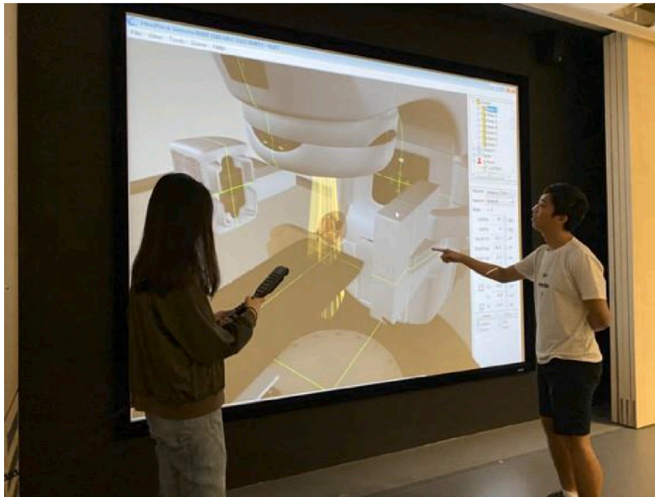
Fig. 2. Students using VERT to view a projection of a linear accelerator, complete with controls that be used to operate it.

available and widespread. The two most utilised devices are the Oculus (Meta) and HTC Vive lines of hardware. Both are headsets that, when worn, completely replace the field of vision in both eyes with stereoscopic screens. Combined with built-in processing hardware, they generate imagery that the brain interprets in 3 dimensions. Since it obscures any ability to see outside of the headset, the user is completely immersed and transported in first-person to an entirely different virtual environment [21]. In addition, newer systems allow for hand, body and even eye tracking in an effort to allow users to simulate a level of interaction within the virtual environment in a safe, reproducible and deterministic manner [22].