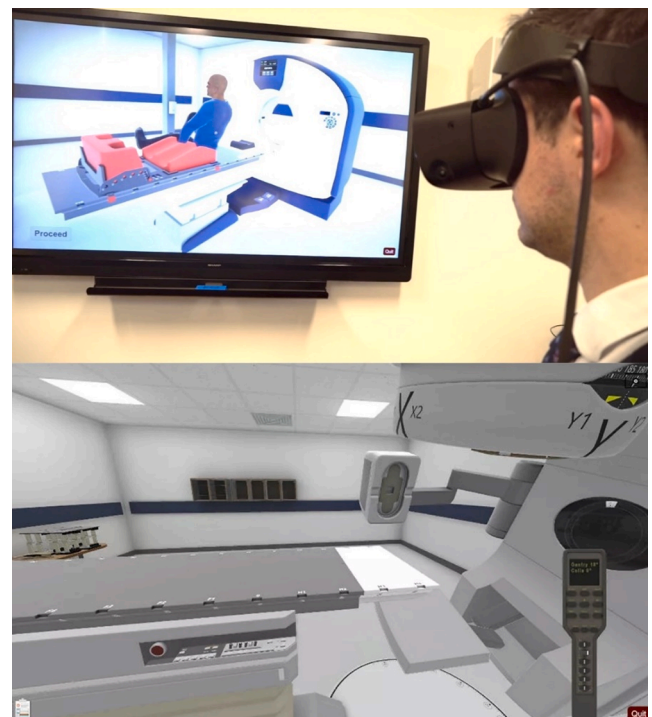
Fig. 3. Fully immersive radiation therapy environment. Top – Learner wearing a 3D stereoscopic headset (with on-screen image showing indicative view of what the learner is seeing). Bottom – Radiotherapy Linear accelerator as depicted in the 3D environment.

The data for its educational utility is nascent, but growing. In an initial study utilising the CETSOL system, we trained radiotherapy students in patient positioning using both an immersive VR environment and a conventional screen-based simulated environment. Students self-rated competence levels following the training were on average 24 % higher for using the immersive VR environment [23]. Also, when the same immersive VR software was compared to clinical role-play, considered to be the current gold-standard for clinical training, there