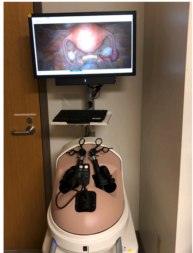
Fig. 1. Laparoscopy simulator comprising facsimile instruments and 2D screen visualisation (reproduced from Molina et al [12] under Creative Commons Licence).

Radiotherapy similarly pioneered a first generation VR solution for training of radiation therapists (RTTs) in the early 2010s. Known as Virtual Reality for Radiation Training (VERT), this VR experience comprises a (typically life-size) projection onto a screen or wall that,