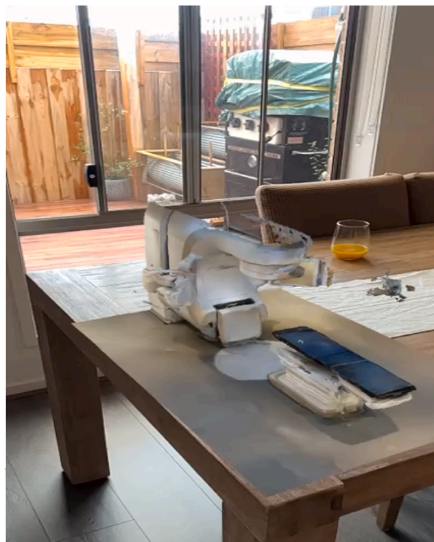
Fig. 4. AR representation of linear accelerator overlaid on a kitchen table.

In the near-future, AR headsets may be able to seamlessly bring