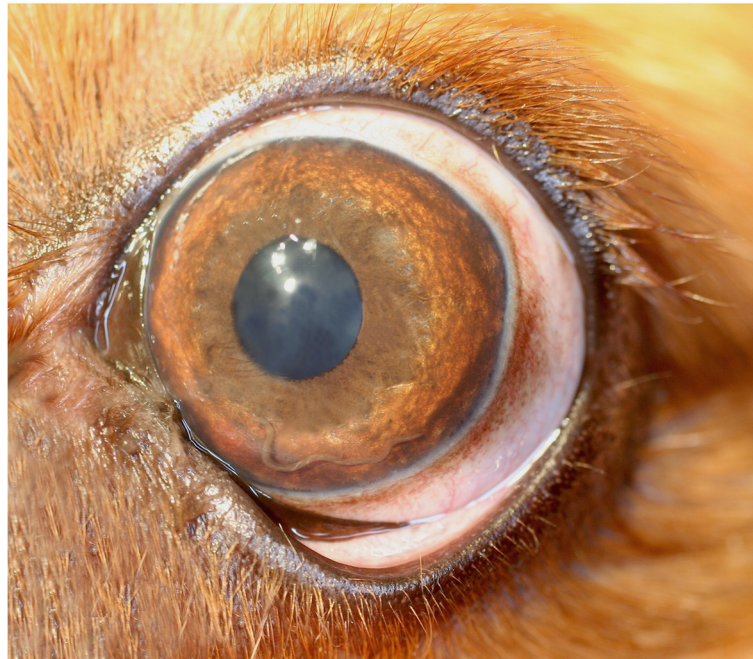
Fig. 2 Case 2. Angiostrongylus vasorum in the anterior chamber of the left eye of a dog

cuticle. However, the nematode was damaged and further morphological features were not evaluated, with the exception of the uteri, which lacked first-stage larvae, and the vulva. Therefore, the dog was subjected to coprological examination for the detection of L1 using the Baermann technique. The 18S rDNA sequences obtained from both L1 collected from the faeces and the female nematode displayed 100 % identity to the nucleotide sequence of A. vasorum [GenBank: AJ920365]. The dog lacked any signs of respiratory infection, both previously and during the observation period. The animal was treated with fenbendazol 25 mg/Kg per os SID for 3 weeks associated with prednisolone 0.2 mg/Kg.