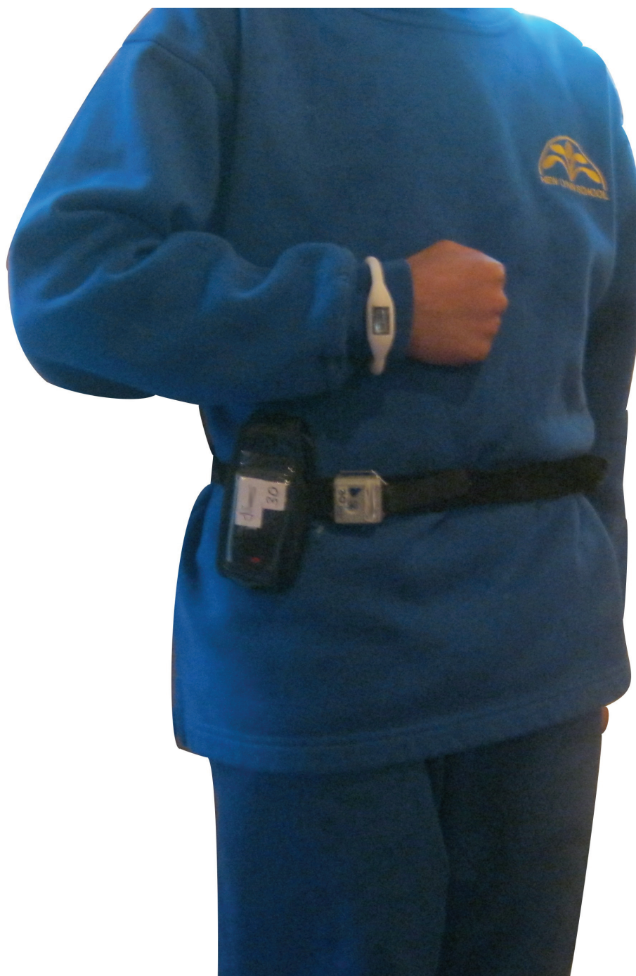
Figure 3 Image of children wearing their belts with GPS unit and accelerometer attached.

Height (shoes off) was assessed to the nearest 0.1 cm using a stadiometer (Mentone Educational Centre, Victoria, Australia) and weight (in light clothing) to the nearest 0.1 kg using calibrated Seca 770 scales (Protec Solutions Ltd, Wellington, New Zealand). Measures were repeated twice; if these measures differed by more than 0.5 cm or 0.5 kg for height or weight, respectively,