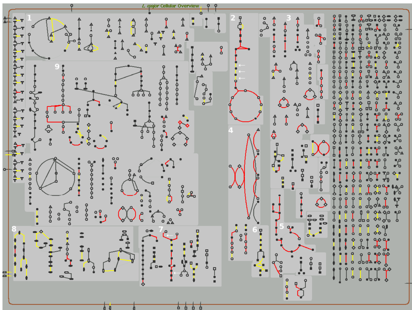
Figure 2 Overlay of proteomic data sets using the LeishCyc Omics Viewer. Changes in the proteome of L. donovani promastigotes and axenic amastigotes [40] were mapped on to the Cellular Overview using the Pathway Tools Omics Viewer functionality. The supplied gene IDs for L. donovani / L. infantum were converted to the corresponding L. major orthologs prior to mapping. Lines (representing proteins) coded in red represent enzymes that were increased in amastigotes, lines in yellow represent enzymes that were decreased. Selected pathways/pathway groups are numbered as follows: 1 = amino acid biosynthesis; 2 = glycolysis and the tricarboxylic acid (TCA) cycle; 3 = amino acid catabolism; 4 = oxidative phosphorylation; 5 = fatty acid beta oxidation; 6 = pentose phosphate pathway; 7 = gluconeogenesis; 8 = nucleotide biosynthesis; 9 = ergosterol biosynthesis. The arrows in the glycolysis and gluconeogenesis pathways are enzymes specific to these pathways [40].

Figure 2 shows alterations in protein expression levels during the differentiation of L. donovani promastigotes to in vitro differentiated (axenic) amastigotes [40], mapped onto the LeishCyc pathways. Enzymes that are decreased in the amastigote stage are shown in yellow while those that are increased are shown in red. Decreases in expression levels of enzymes involved in glycolysis (3 enzymes) and the pentose phosphate pathway (6 enzymes) are apparent, as are increases in enzymes involved in gluconeogenesis (2 enzymes), oxidative phosphorylation (4 enzymes), amino acid catabolism (3 enzymes), and fatty