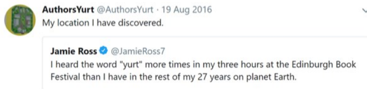
Figure 4: @AuthorsYurt discovers its location.

@AuthorsYurt also retweeted the sharp observation in Figure 4 about the overuse of the word “yurt” at the festival, to emphasize both the Yurt’s cultural and physical (dis)location, and the satirical intent of the account: 37