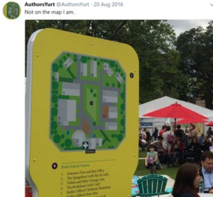
Figure 5: @AuthorsYurt notes it is not on the map.

Some authors enthusiastically embraced the possibility of having an online conversation with @AuthorsYurt, taking advantage of Twitter’s interactivity. A.L. Kennedy, whose observations in On Writing we referred to earlier, seemed particularly taken with @AuthorsYurt, comparing its turns-of-phrase to Yoda’s, and sending a series of cheeky tweets. Adding to the humour, a second Authors Yurt account was set up (by person or persons unknown to us), then a third joined the fray, flirting with horse gifs and the lure of the Mongolian plains. The original @AuthorsYurt took the opportunity to satirize the quantification tendency of creative industries discourse, by counting the number of Authors’ Yurt accounts. In response to a journalist’s tweet that reported festival “ticket sales up 3.5% and more than 62,000 books sold this year,” @AuthorsYurt tweeted, “Also, talking yurts 3 from 0 up.” 42