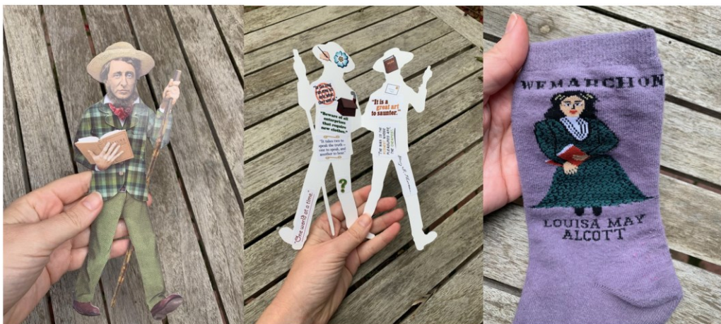
Figure 8: Literary tourism: Transcendentalist paper doll cards and socks.

In the era of late capitalism, cultural tourism, Etsy, and quirky merchandising, it is not very surprising to come across dolls made to resemble literary figures. Fans of writers can buy such products as an expression of their enthusiasm, just as they may buy other literary merchandise, or undertake pilgrimages to literary sites and writers’ houses. 46 On a tour of Massachusetts writers’ houses in 2019, for example, we bought paper doll cards of Ralph Waldo Emerson and Henry David Thoreau, adorning them with quotable stickers. We also bought socks that feature a doll-like image of Louisa May Alcott under the slogan “We March On” (see Figure 8).