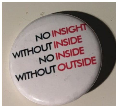
Figure 1: Nunu Otot button badge.

NO INSIGHT WITHOUT INSIDE NO INSIDE WITHOUT OUTSIDE