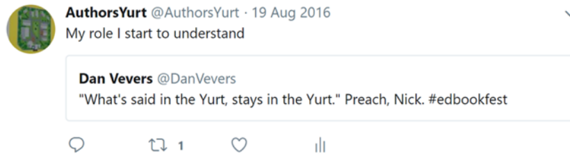
Figure 3: @AuthorsYurt achieves consciousness of its role.

@AuthorsYurt also retweeted the sharp observation in Figure 4 about the overuse of the word “yurt” at the festival, to emphasize both the Yurt’s cultural and physical (dis)location, and the satirical intent of the account: 37