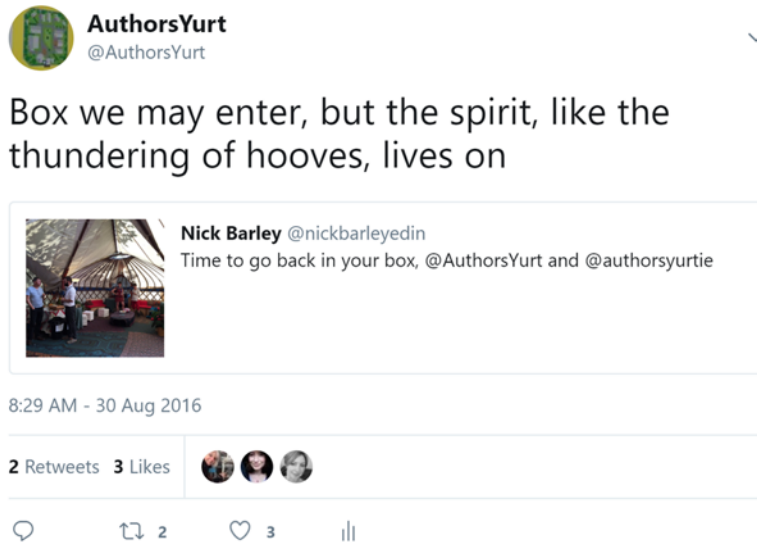
Figure 7: @AuthorsYurt goes back in the box.